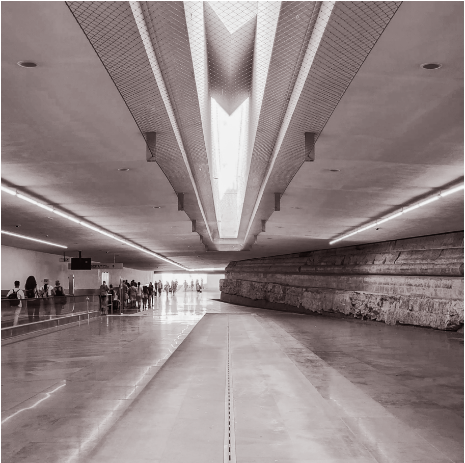
"Piazza Municipio metro station, Naples".