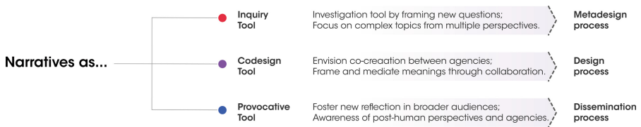
Fig. 3. The different roles of narratives within the speculative radical design, their possible uses, and involved processes of meaning creation: (i) as inquiry tool; (ii) as codesign tool; and (iii) as a provocative tool.

through the provotype , especially dealing with more-than-human agencies (Fig. 3): (i) inquiry tool; (ii) codesign tool; and (iii) provocative tool.