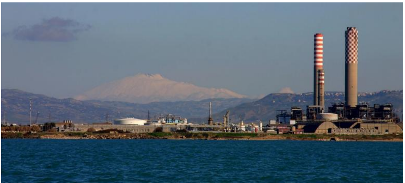
Figure 2 - View of the vast petrochemical complex in Gela, Sicily