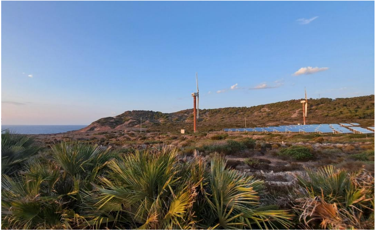
Figure 3 - abandoned turbines and new photovoltaic plant on San Pietro Island, Sardinia