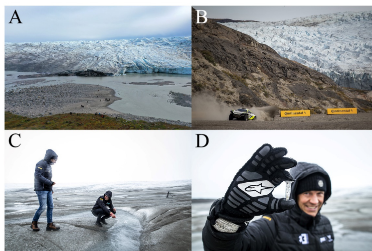
Figure 1. Extreme E sampling in Greenland. (A,B): Extreme E road racing; (C,D): Extreme E after sampling on ice.

Sampling was conducted in a single session one day prior to the race event. The selected icefield was located in the vicinity of the race area but was not part of the racetrack and had not been subjected to racing or tourist activities. The sampling site consisted of undisturbed surface ice, minimizing the likelihood of direct contamination associated with the race itself. Nevertheless, given the touristic accessibility of the area, potential contributions could be linked to broader anthropogenic activities or atmospheric deposition.