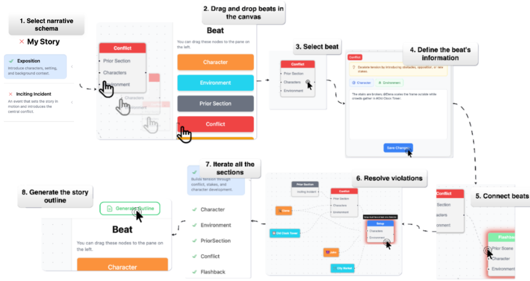
Figure 2: A step-by-step walkthrough of the pipeline's stages inside StoryPilot.

canvases and edit it, otherwise can download the draft containing all the guidance and information.