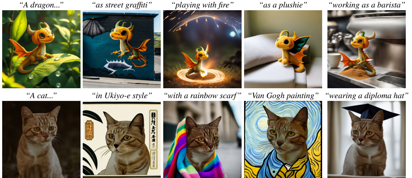
Figure 2. Personalized generations by DreamCache. The first column contains reference images. The generated images correspond to the text prompts above each column.

V projections for the cross-attention blocks of the U-Net. Text-based personalization methods optimize single (like Textual Inversion [6]) or multiple (like in P+ [32]) input token embeddings. Later methods [1, 8, 30, 35] build on these, with innovations like Perfusion [30] using dynamic rank-1 updates to prevent overfitting while keeping encodings lightweight. However, all finetuning-based methods are computationally intensive, often requiring minutes of finetuning per reference subject at test time.