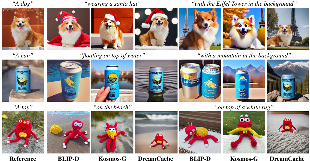
Figure 4. Visual comparison. Personalized generations on sample concepts. DreamCache preserves reference concept appearance and does not suffer from background interference. BLIP-D [13] and Kosmos-G [19] cannot faithfully preserve visual details from the reference.