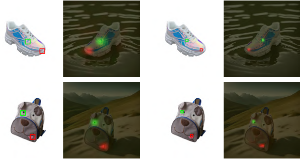
Figure 5. Visualization of reference image impact. Cross-attention maps between cached reference features and features of the image under generation. Left: attention map at layers at 16 \times 16 resolution (left reference, right generated). Right: 32 \times 32 . Attention values are highly localized in the region of interest.

Dataset Impact We demonstrate the importance of our synthetic dataset to train the conditioning adapters and the effect of scaling its size. For this purpose, we created synthetic datasets according to the procedure in Sec. 3.3 of sizes 50K, 200K, and 400K samples. We also tested the real-world 5M samples from the LAION [26] dataset, which, lacking target-caption-reference triplets, required reuse of target images as reference images too. Table 7 shows that increasing dataset size improves image alignment, though slightly reduces textual alignment. Notably, LAION improves image alignment but struggles with textual alignment. This highlights the importance of triplet data (target image, reference image, and caption) for effective zero-shot personalization, ensuring both subject preservation and textual editability.