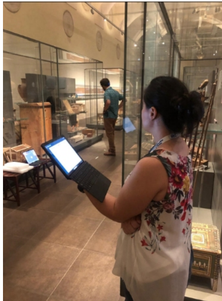
Figure 1: Egyptian museum experiment: experimentations on the Kha and Merit treasure (July 2024).

The aim was to monitor the emotional impact in the presence of human remains.