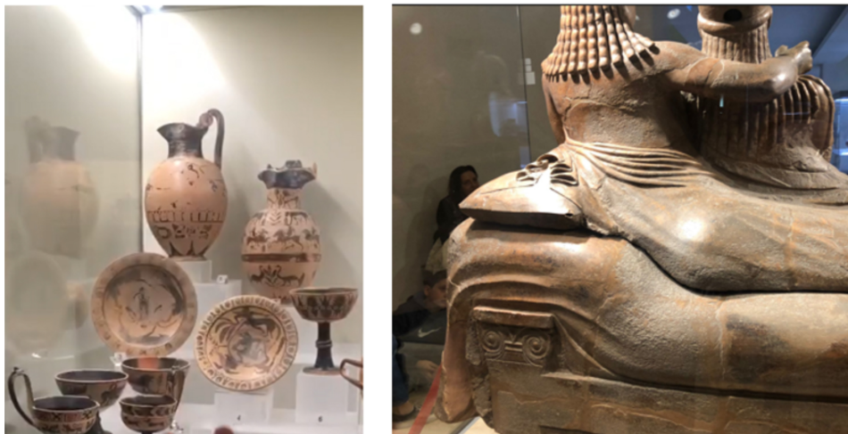
Figure 5: Experiments at ETRU museum, (November 2024): funerary goods and detail of Sarcophagus back.

At the end, in Cerveteri, the participants were asked whether they wanted to move on to the original tumulus of the Sarcophagus or to the most beautiful tomb in the entire necropolis, while at ETRU museum they were asked whether they wanted to move on to museum visit or whether they were willing to go back to the previous room to observe more in depth funerary objects belonging to the Etruscan men and women.