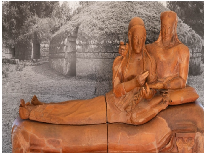
Figure 2: Necropolis of Banditaccia (Cerveteri, near Rome): “Sarcophago degli Sposi” (copy).

The sample consisted of volunteers from the Red Cross, which given their support to the project through a letter of interest and represented a vary heterogeneous audience.