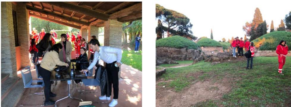
Figure 3: Experiments in Cerveteri, (November 2024).

The second experimentation focused on the “Sarcofago degli Sposi” involved the original piece, displayed at the ETRU Museum.