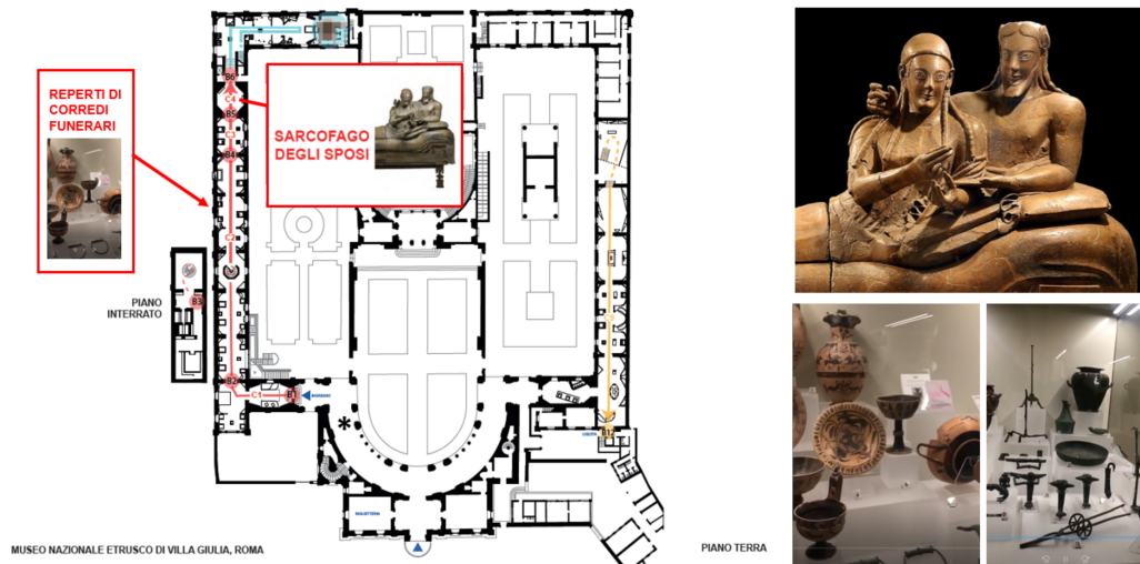
Figure 4: Experiments at ETRU museum, (November 2024).

to provoke reflections on mortality (Cerveteri) and the woman's role in the Etruscan world.