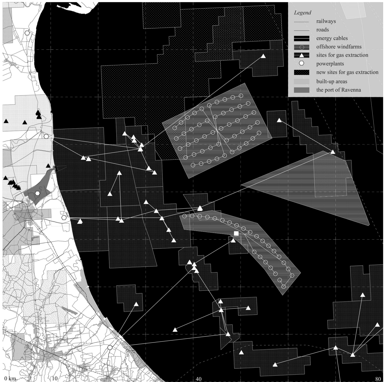
Fig. 1 Ravenna energy landscape. Map by the author

Finally, due to the growing energy-related economy, an eco-friendly urban expansion is occurring in the oldest part of the Port, known as Darsena di Città. Beginning in the 1960s, this 100-hectare industrial site near the city centre and the railway station was gradually abandoned. In the mid-1990s, the municipality approved a master plan by Marcello Vittorini for the redevelopment of the area into a new residential district. The proposal was, however, oversized with respect to the demographic trend and the market demand of that period, and it was never implemented (Codecasa and