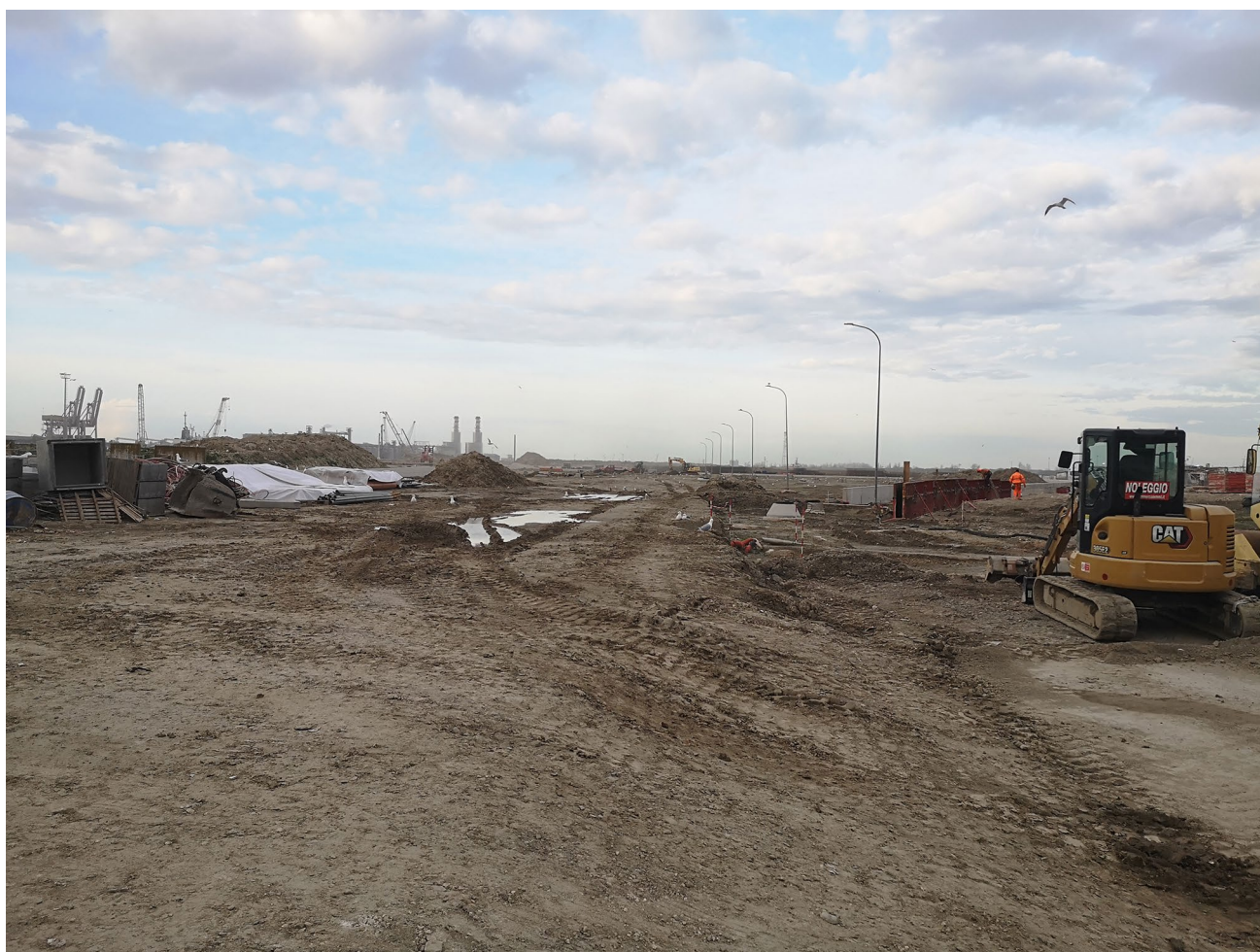
Fig. 2 New container terminal under construction on the former silt storage.

establishment of new industries is reviving this urban transformation. The CIA-Conad Cooperative has invested 100 million euros to convert seven hectares of former industrial sites into a new urban area. This will include 27,000 m 2 for public spaces, 8500 m 2 for commercial activities, 6000 m 2 for social housing and luxury residential towers along the canal, and 4000 m 2 for offices. Contemporarily, commercial activities, sport facilities, and advanced manufacturers have expanded over 20 hectares between the city and Port. To date, these novel buildings host two hectares of rooftop solar panels, and plans have been made to cover another 1.5 hectares of restored buildings. Indeed, these new urbanisations are expected to be sustainable and self-sufficient as part of the municipal attempt to cut CO 2 emissions by 40% by 2030. 9 This goal has to be achieved by means of infrastructural projects which connect urban and port infrastructures,