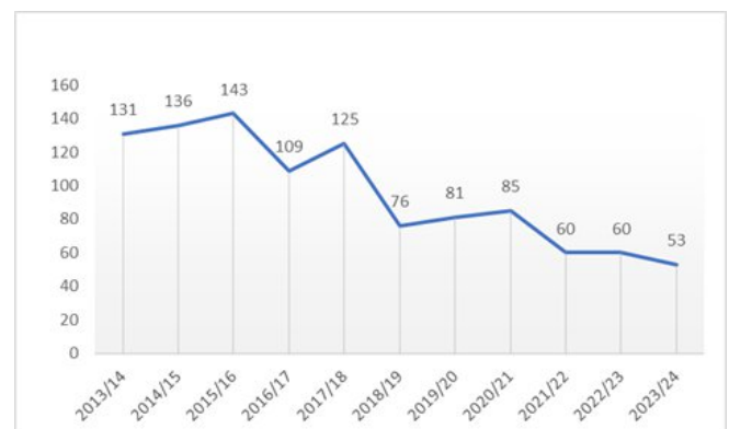
Fig. 1: Number of first semester students in Electrical Engineering over the last ten years.

Against this backdrop, Europe is facing an already chronic shortage of microelectronics workers with skills gaps being one of the biggest challenges that undermine the growth potential of not only the semiconductor industry, but the European economy as a whole. In the most recent report of European Labour Authority, STEM profiles were identified as profiles of high magnitude shortages [7]. Likewise, nearly 1.1 million job advertisements for electrical- and electronic engineers were placed in the EU between mid-2018 and the end of 2019 (CEDEFOP, 2020). A university of technology in Austria reports a 60% drop in student inflow in electrical engineering over the last 10 years (see Fig. 1) Similar patterns exist in other universities across Europe.