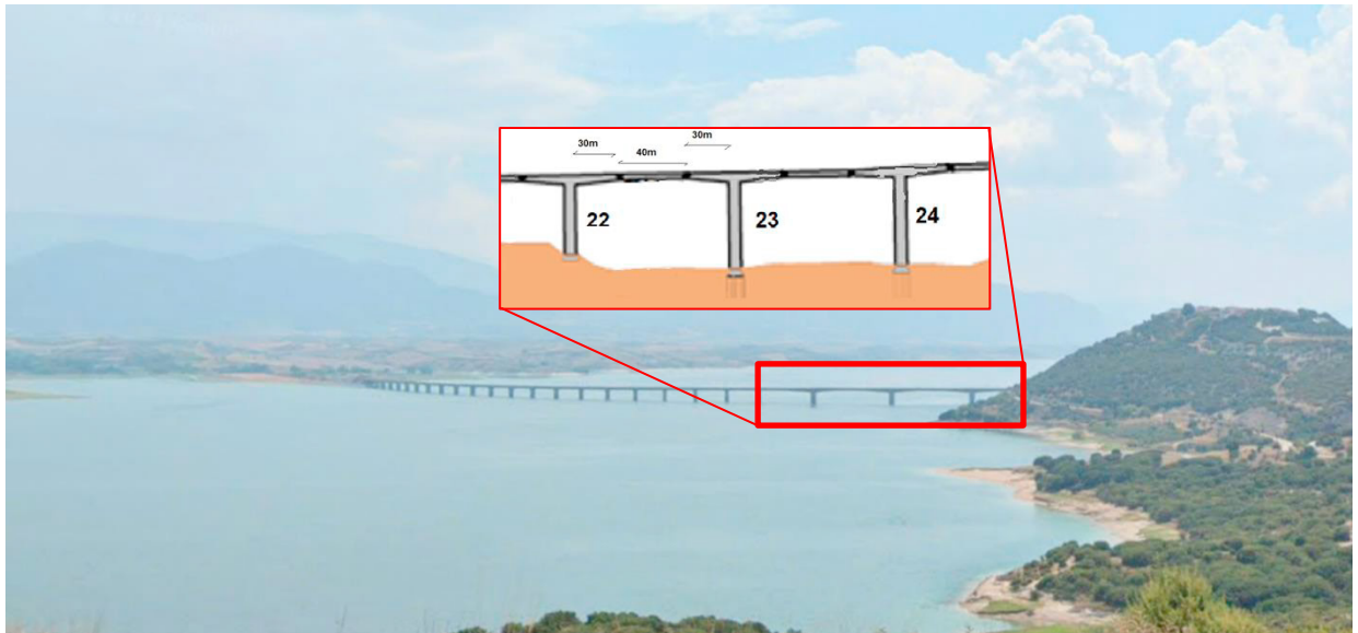
Fig. 1. General view of the Polyfytos lake and the bridge with the detail of Piers #22, #23, #24.

This approach, while not conclusive on its own, offers reliable information to engineers and the infrastructure operators, offering a digitally streamlined, cost and time efficient, and environmentally friendly solution with minimal structural interaction.