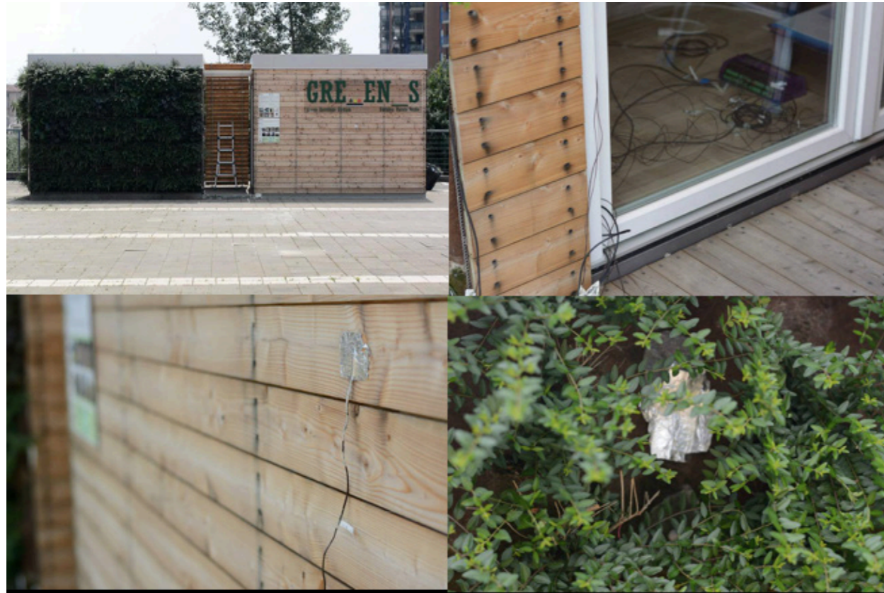
Figure 5. The GRE_EN_S sample building is located in Turin (I). Latitude: 45°04'13". The picture shows the building's surface temperature sensors.

Figure 5 shows a building divided into two independent portions. The first (left) is the Living Wall System developed within the GRE_EN_S project. The second (right) is an insulated wood-clad façade. Both facades have the same theoretical U-value. The two sample building portions were equipped with radiant heating panels with temperature sensors for the winter period.