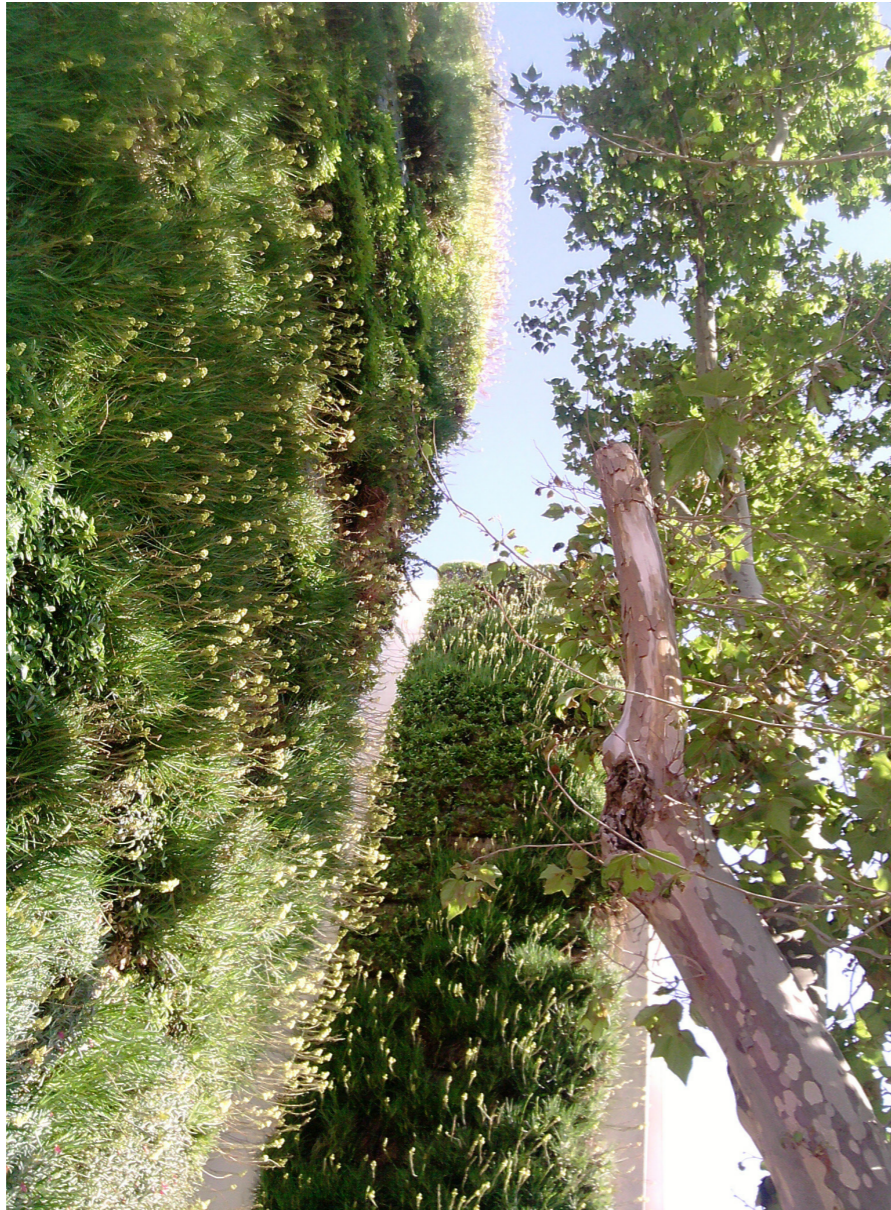
Figure 3. City of Valencia. Example of an integration of Nature-Based Solutions in the urban habitat.

water flows, filtering water, and reducing the risk of floods. They can also enhance water availability during dry periods and recharge groundwater reserves.