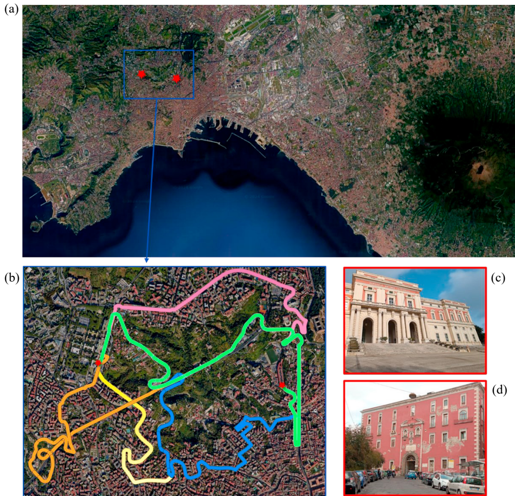
Fig. 1. (a) Satellite image of a part of the city of Naples, Italy, sourced from Google Maps, and (b) hilly area of Naples, in a close-up view integrated with QGIS, with the five paths forming the relevant RN. The red stars indicate the locations of the two hospitals, i.e., (c) Cardarelli Hospital and (d) San Gennaro Hospital.

classification (Grünthal & European Seismological Commission. Working Group “Macroseismic Scales,” 1998). These DSs correspond to the following levels of damage for vertical structures: no damage (DS0), insignificant to negligible (DS1), considerable to serious (DS2), very serious (DS3), partially collapsed (DS4), and collapsed (DS5). We have fixed that reaching a PGA capacity corresponding to an intermediate DS between DS1 and DS2 is adequate to trigger road interruption in the case of Scenario Sc50 with a return period T_r = 50 y. Conversely, reaching DS3 would lead to road interruption in the case of Scenario Sc475 with return period T_r = 475 y. Part of the city of Naples, in southern Italy, is identified via QGIS and depicted in Fig. 1(a). The hilly area of Naples (“Area collinare di Napoli” in Italian), as depicted in Fig. 1(b), is a densely populated region known for its historic significance, cultural richness, and bustling atmosphere. It is mostly dominated by residential neighborhoods and is home to a significant portion of the city's population. Moreover, this area is host to critical healthcare facilities, such as the two critical nodes of this study, i.e., Cardarelli Hospital and San Gennaro Hospital, which are respectively depicted in Fig. 1(c) and 1(d).