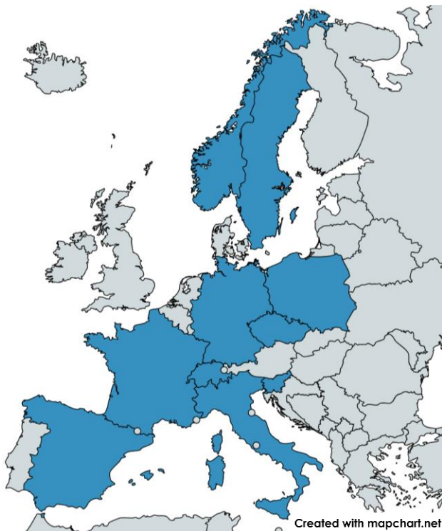
Figure 2. European countries represented in the WGS of ELGIP.

In the next step, the activity is evaluated quantitatively by roughly assessing the level of involvement in relation to the SDGs. The assessment is performed by determining the number of institutes of WGS actively working towards each SDG. The quantitative evaluation is put into perspective using the global level of achievement of the SDGs estimated by averaging the realisation of the specific targets presented by Miranda et al. (2023) for each SDG in UN's Global Sustainability Report 2023.