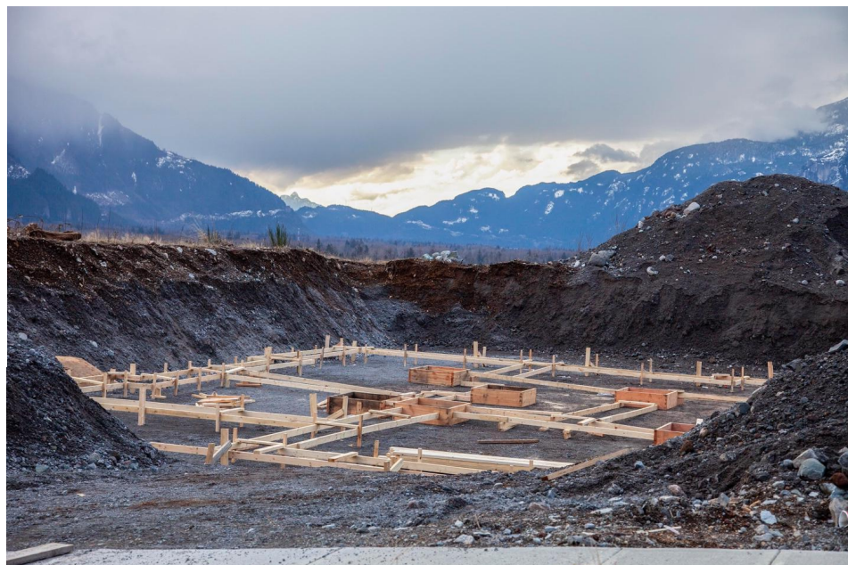
Figure 5 Squamish Landscape.

I can only speak for Squamish, but there's a big outdoor scene here, so there are a lot of climbers, mountain bikers and skiers who tend to live more semi-nomadically and live in vehicles for the lifestyle. However, there are also a lot of people living in vehicles because