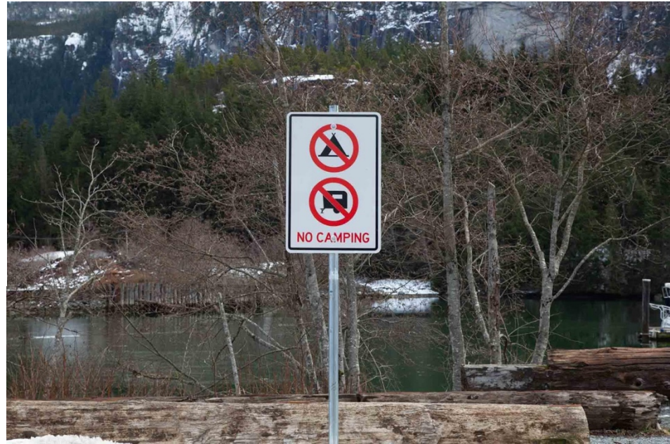
Figure 3 Squamish Landscape.

of campers who may stay there for less than market value. The state sees land through the lens of capital. In Squamish, they shut down the municipal campground despite a huge demand for more campground space.