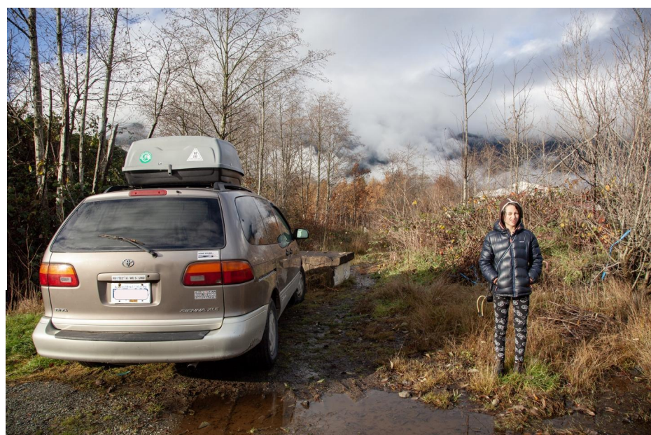
Figure 10 Cedar. Photo courtesy of Thomasina Pidgeon

Thomasina: I do not want to conflate the two struggles, as the racism, discrimination and oppression that Palestinians experience is much more intense. We are not being displaced from our homes, bombed, starved and killed. Our lives are not being threatened, only our wellbeing and sense of security. We are simply being woken up and told to move our homes off public land. This is not ok either, but there's a significant difference in the intensity and effect. Simultaneously, we are both "Othered". Palestinians face discrimination and prejudice like being called "human animals" by state officials, while vehicle residents have been called "tax-evaders and filth on our street". The intensity is different, as well as the implications, but there are similarities in the underlying mindset of superiority. I've talked to one of my Squamish Nation friends about the bylaw, and without seeing it as a comparison of their experience with ours, she understood that the core of the problem with the bylaw stems from the same colonial thinking of domination and "Othering" that resulted in the theft of their lands.