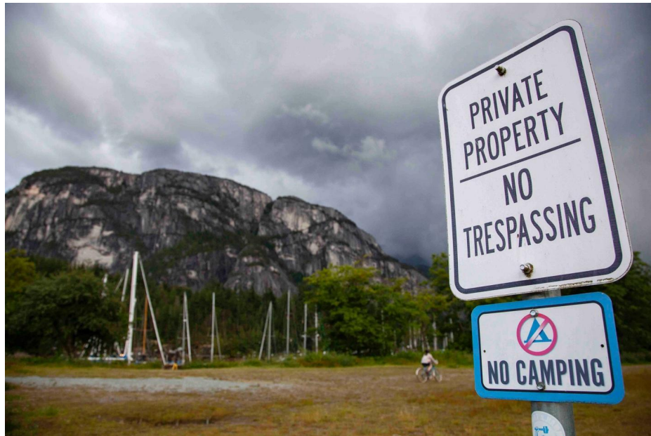
Figure 9 Squamish Landscape.

Vehicle residency challenges dominant colonial and capital ideas around property, consumerism, and who “rightfully” does or does not belong. It challenges the generic idea of what is a “home”, as well as how much material wealth we need to survive and live comfortably. For example, do we really need running water and a shower every day? There are ways to meet our needs, like eating and going to the bathroom, while living in a vehicle... It’s just done a little differently in a vehicle. I actually make better meals on the stovetop of my RV than some of my housed friends! And while I now have a toilet in my RV, before that, I made use of public toilets. Imagine how people meet those needs when they go camping... It’s similar, but in a vehicle it is actually easier because the vehicle can store things like a stove.