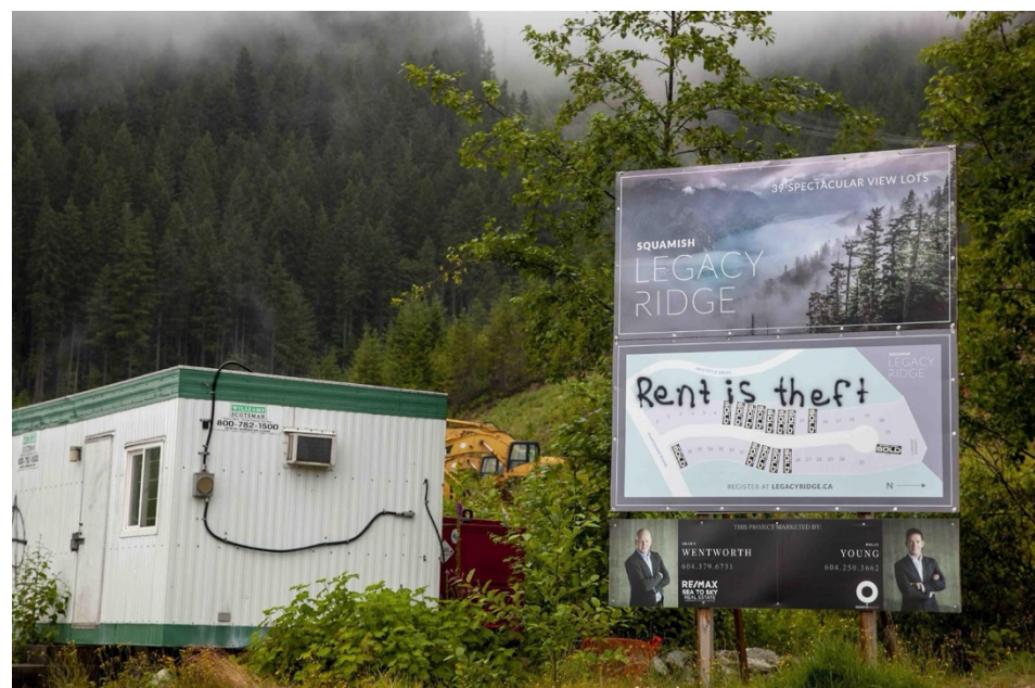
Figure 2 Squamish Landscape.

Thomasina: Well, that first van did not drive, so I hadn't yet experienced the benefits of mobility. Once I got a vehicle that drove, the whole world opened up. You could drive a little further to change the view out of your window. Not being anchored to one spot made me feel freer. I also met more people, and internally, I felt more creative. As a kid, I always wanted to go camping or to put my tent in the backyard and sleep outside, rather than sleep in the house. I've always had this urge to roam. There's something about moving and change that makes me feel more alive and stimulated. When I'm living in a house, which I did from time to time, I feel stagnant and stuck, like I'm chained down. Financially, I had to work a lot more so I could afford rent. I've never had a good paying job until now so rent took more than half of my income. This is straining in itself, especially with a young child. Spending your life working at a job that's not very fulfilling