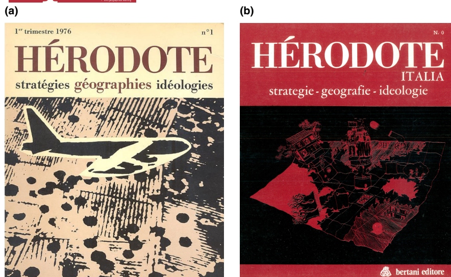
FIGURE 1 Covers of the first issues of the journals Hérodote , published in France since 1976, and Hérodote Italia , published in Italy since 1978.

become—through an apparent paradox—mainstream (Kitchin, 2005), in Italy this never happened, and a purely Marxist geography was more nuanced, and minoritarian, as well as other critical stances.