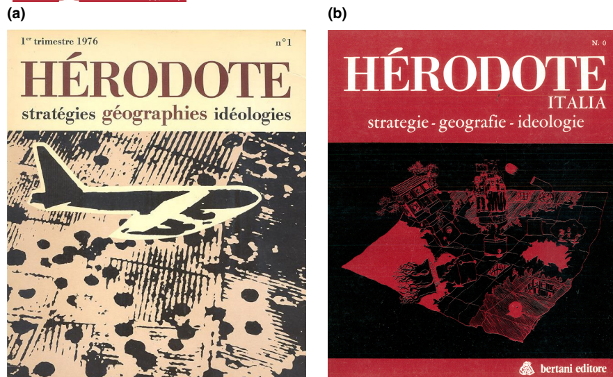
FIGURE 1 Covers of the first issues of the journals Hérodote , published in France since 1976, and Hérodote Italia , published in Italy since 1978.

become—through an apparent paradox—mainstream (Kitchin, 2005), in Italy this never happened, and a purely Marxist geography was more nuanced, and minoritarian, as well as other critical stances.