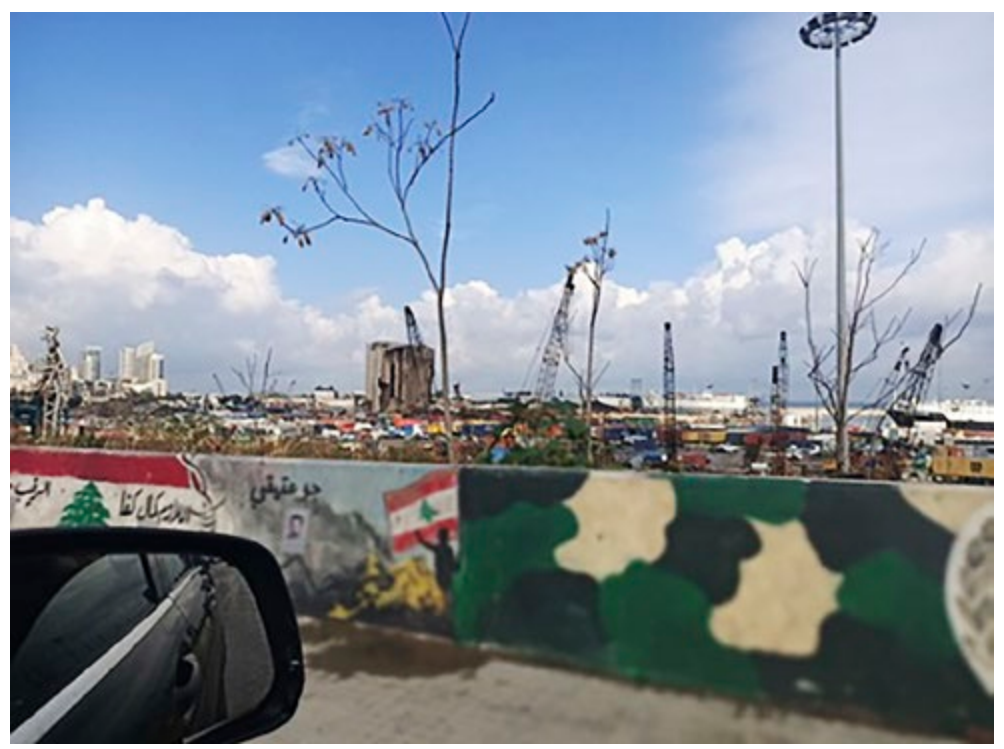
Figure 1. Lebanon, Beirut, port explosion site.

Life and death. Traumatized, alienated and dominated by the heavy burdens of crises, Lebanese people have incessantly been negotiating the meaning of their individual and collective life through a palimpsest of everyday practices, trajectories and spatial representations intertwined with unique coping strategies. Cyclic, repetitive and only growing in intensity, the memories of the war figure and refigure in the minds of the Lebanese and in the spaces of their city. Queues, repeated visits and trajectories between 'familiar' and 'other' areas are spatial forms and movements that reinvigorate the war's own. "We are still searching for the meaning of life amidst the unhealed traumas and recurrent deceptions. Our life is just a living it is just a matter of life priorities", said Ahmad.