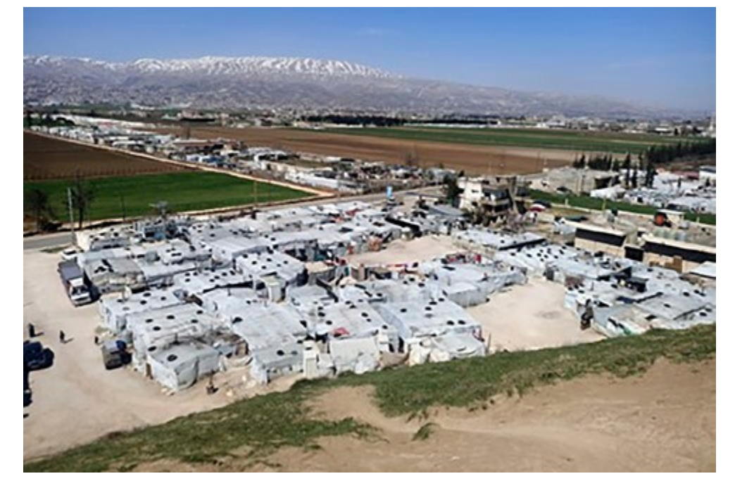
Figure 2. Lebanon, Bar Elias, Tell Serhoun, informal tented settlement. Photo by the author, 2023.