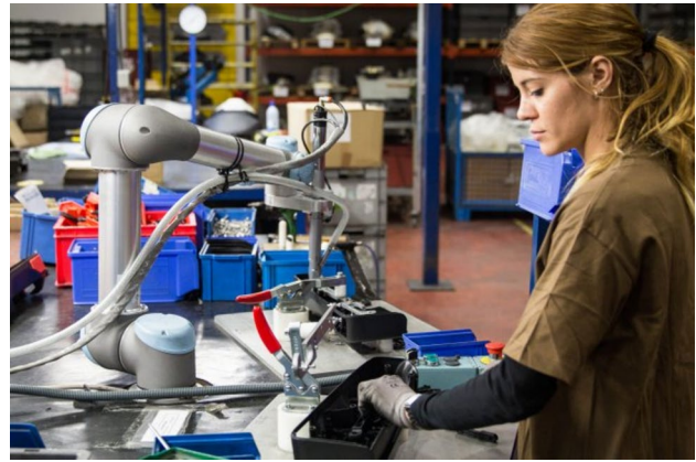
Fig. 1 Cobot-supported operator for a manual assembly task

The current market includes a relatively wide range of cobot models, which could be adapted to the context of interest. The company management decided to identify the most appropriate cobot depending on the programming-practicality attribute, which is crucial in making task preparation faster and easier, while reducing the level of technical skills required by operators (El Zaatari et al. 2019). The following five cobot models were selected from those