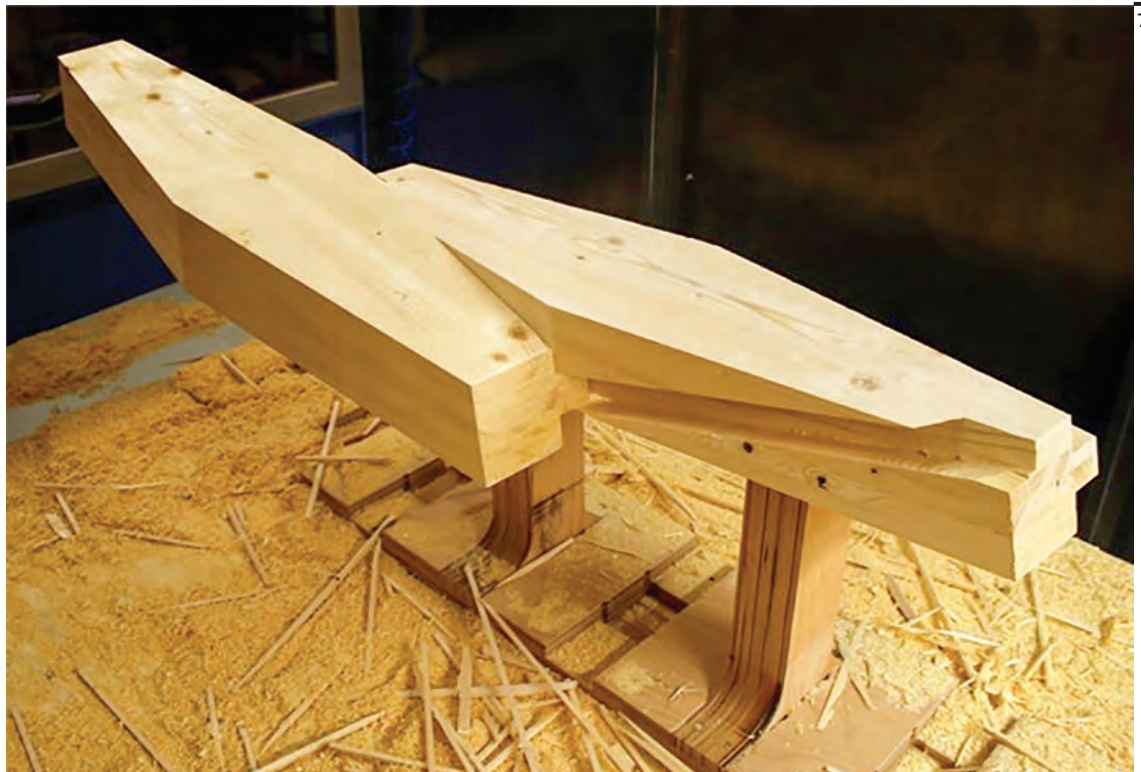
Fig. 7 Hexagon massive timber trunks forming a continuous shell structure by means of lateral wood- wood connections.

Florian Court explains his philosophy: «The central issue, however, lies in the possibility of industrialising local wood supply chains and preserving the cultural identities of individual territories. The variety of Alpine forests and the richness of the vernacular architectural heritage constitute important resources that should serve as a starting point