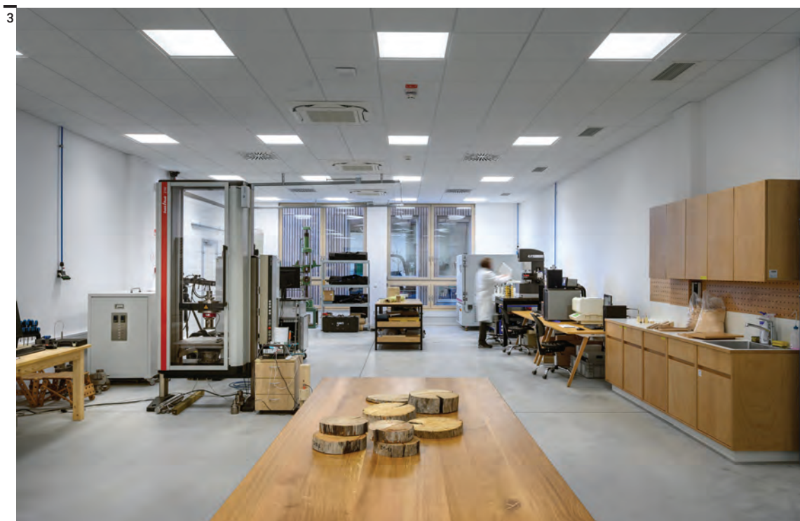
Fig. 2 The high-performance Computing lab, InnoRenew CoE.