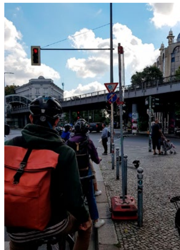
Cycling at an intersection, Berlin traffic. (2022)

The key to rethinking field trips, then, is to balance conventional classroom learning with personal sensory discovery and the critical realisation that there is not one city, but many ways to inhabit the ur-