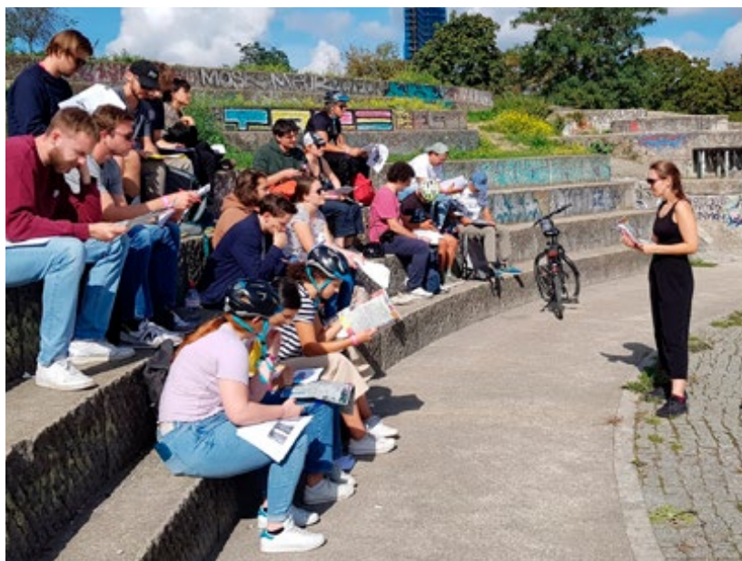
Input talk on urban natures, Görlitzer Park, Berlin (2022)