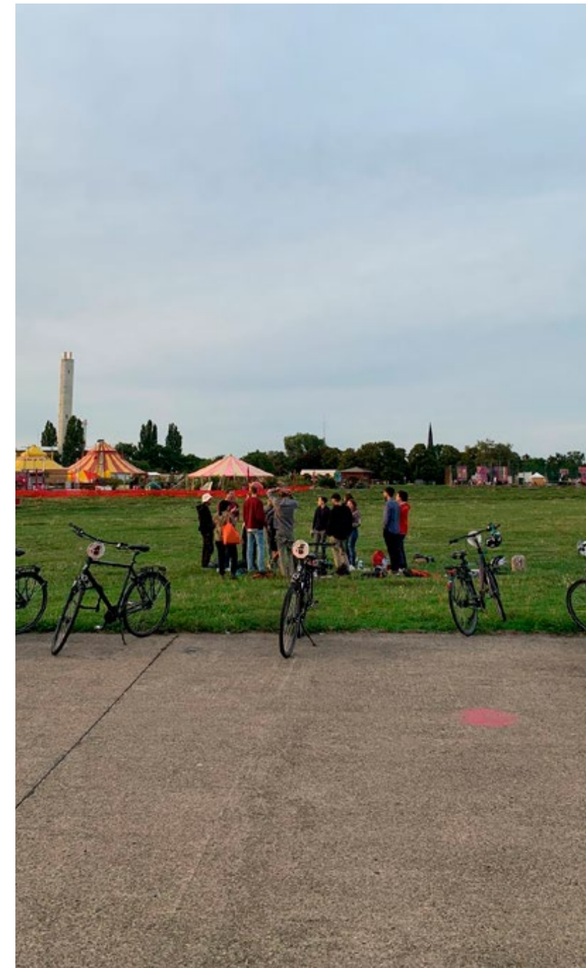
The circle, central figure of communication and interaction during field trips (2022)