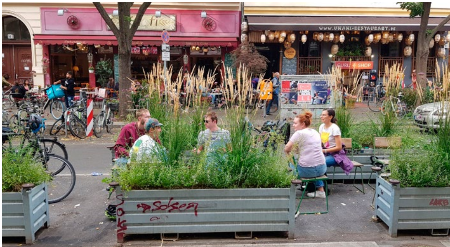
Students discuss their group project in a parklet, in the middle of the street, Bergmannstraße, Berlin (2022)