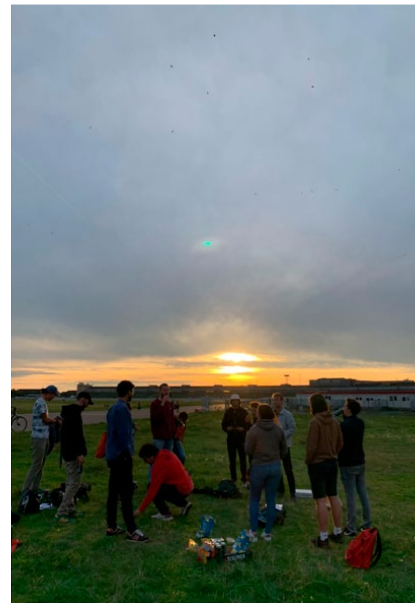
Sunset at Tempelhof Airport (2022)

We are advocates of situated learning, following the pragmatist philosopher John Dewey's (1897) pedagogical credo that effective learning takes place