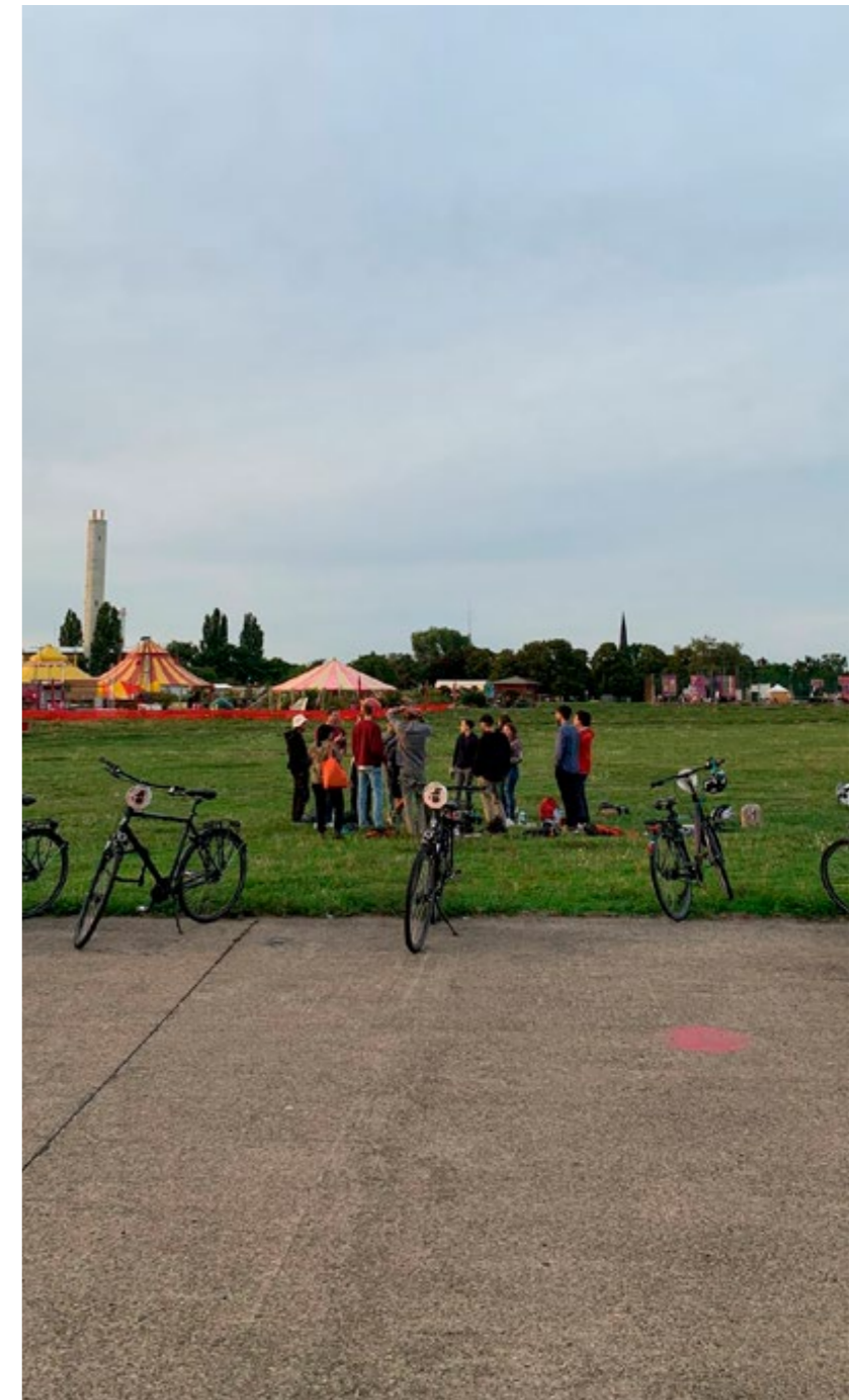
The circle, central figure of communication and interaction during field trips (2022)