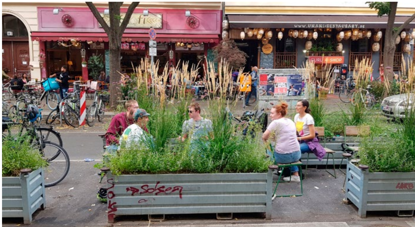
Students discuss their group project in a parklet, in the middle of the street, Bergmannstraße, Berlin (2022)