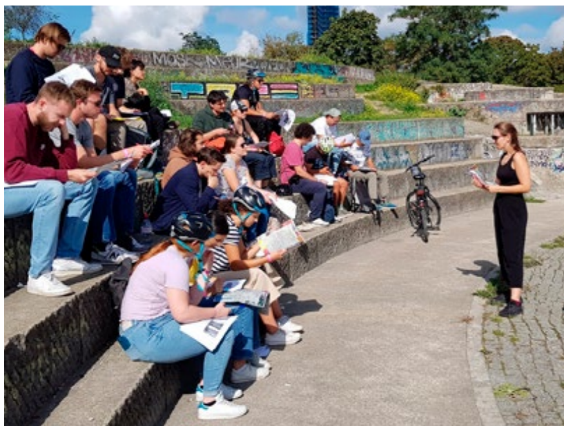
Input talk on urban natures, Görlitzer Park, Berlin (2022)