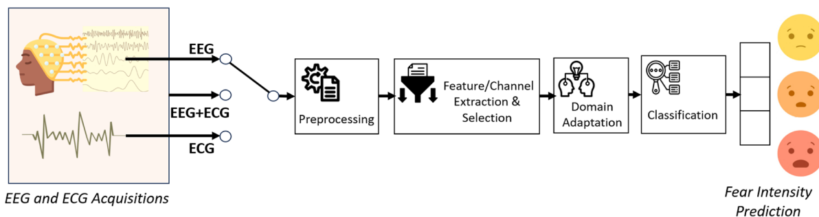
Fig. 6 Pipeline of the classification process involving EEG, ECG, or a combination of both. After the data has been preprocessed and segmented into epochs, suitable features are extracted, along with a channel

The ECG signal processing was developed in Matlab v. R2021b. The Pan Tompkins algorithm (Pan & Tompkins, 1985; Sedghamiz, 2014) was applied to the raw ECG signal for the pre-processing phase. It consists of a series of filtering operations and of a final detection of the QRS complexes