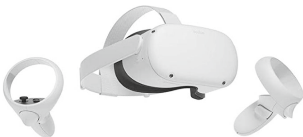
Fig. 2 Meta Quest 2

The exposure to the VR environment was achieved by the Meta Quest 2 (Meta quest 2, 2022), produced by Meta Platforms (Fig. 2). The Quest 2 runs an Android-based operative system, it can be used as a standalone device or can be connected through a wired connection to a PC with the VR software running on it. The headset is provided with a fast-switch LCD display with a per-eye resolution of 1832 \times 1920 and an adjustable refresh rate of 60, 72, or 90 Hz. Loud and left/right positional audio are available thanks to the built-in speakers thus offering the users a more immersive experience. A motion tracker with 6 degrees of freedom (DOF) guarantees precise tracking of the user's head and body movements. Finally, the Meta Quest 2 can be easily integrated in EEG applications due to its small dimensions and weight, ( 224 \times 450 mm, 503 g).