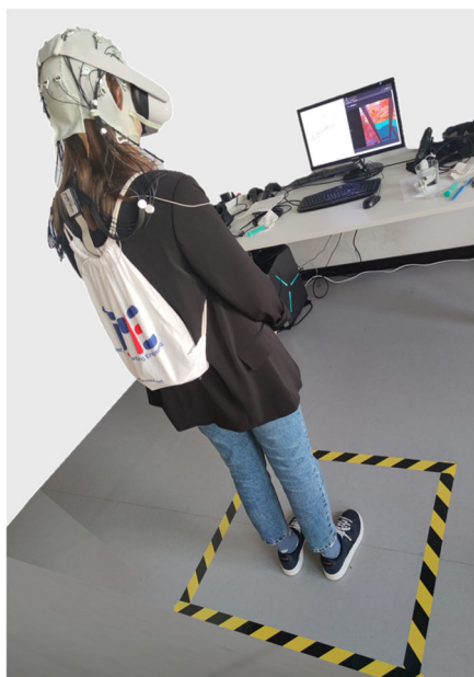
Fig. 5 EEG data acquisition

(ASR) and Independent Component Analysis (ICA) (Arpaia et al., 2022) were employed for removing artifacts from the EEG signal using the EEGLAB Matlab toolbox, version 2019 (Radüntz et al., 2015). For the ASR, a cutoff parameter of 15 was employed in order to retain the brain component of the signal while effectively removing artifacts (Chang et al., 2018). For the ICA, all the components identified as eye, muscle, hearth, line noise, and channel noise artifacts with a percentage greater than 95% were removed. Additionally, subjects’ head movements in the x, y, and z dimensions recorded through the accelerometer sensors were used to further clean the EEG data from movement-related artifacts. Independent components (ICs) previously computed by ICA were band-pass filtered with a 4 th order Butterworth band pass IIR filter between [1 – 10] Hz. The accelerometer data were filtered in the same way. The frequency band was cho-