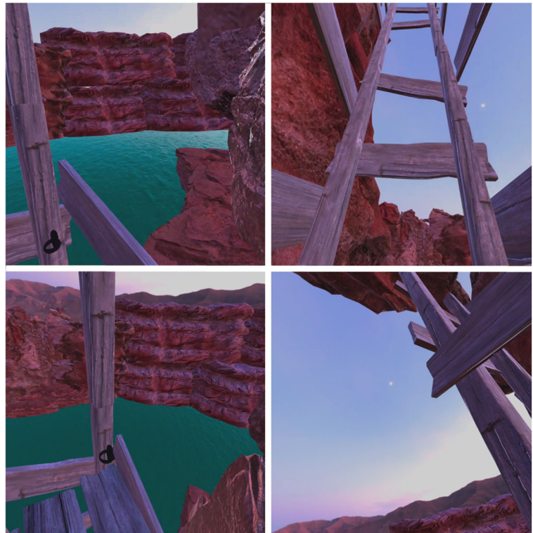
Fig. 3 Eliciting VR scenario

operator. The EEG signals were again visually inspected to ensure no perturbations occurred (Fig. 5).