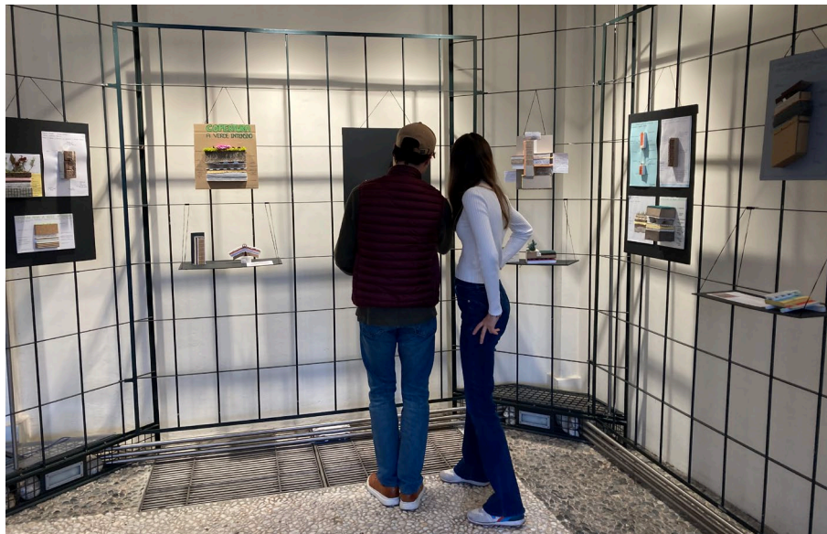
Fig.4 – Detail models exhibition

An exhibition was the first opportunity to present three-dimensional models of architectural details at the School of Architecture. Like the models, the exhibition itself was built at 'zero cost' using recycled materials and waste from previous installations.