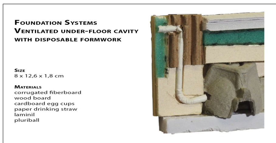
Fig. 1 – Foundation System Model (Card n. 002 - Open Access Catalogue)