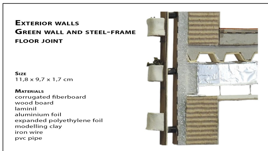
Fig. 2 – Wall and Floor System Model (Card n. 36 - Open Access Catalogue)