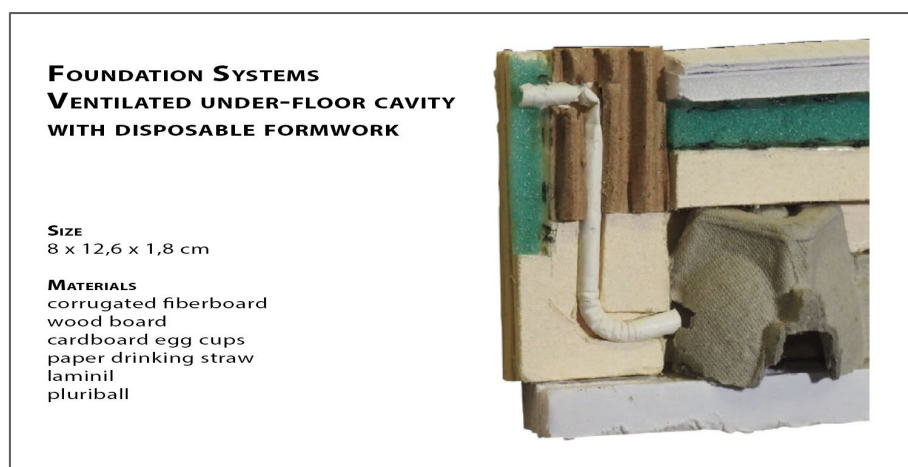
Fig. 1 – Foundation System Model (Card n. 002 - Open Access Catalogue)