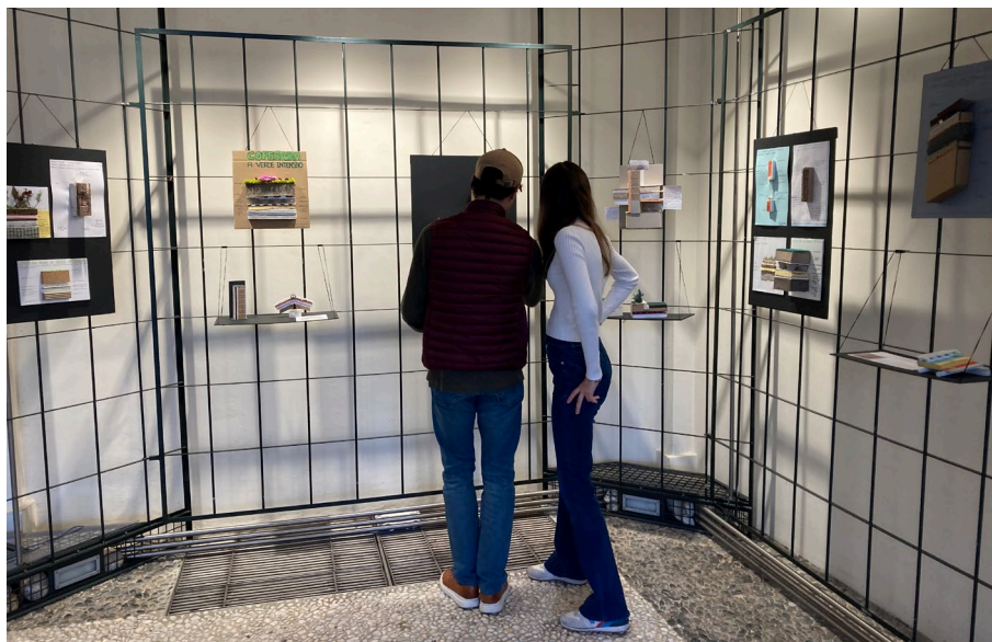
Fig.4 – Detail models exhibition

An exhibition was the first opportunity to present three-dimensional models of architectural details at the School of Architecture. Like the models, the exhibition itself was built at 'zero cost' using recycled materials and waste from previous installations.