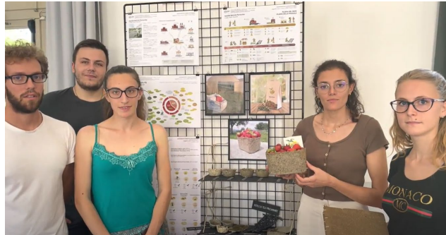
Fig. 4 – Exhibition of projects

discuss together the real feasibility of the identified circularity scenarios (figure 4). This stage assesses students' ability to critically and reflectively answer questions regarding the sustainability of their project proposal and possible impacts in economic, environmental and social terms.