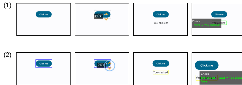
Figure 3: Sample testing session with ScoutDroid