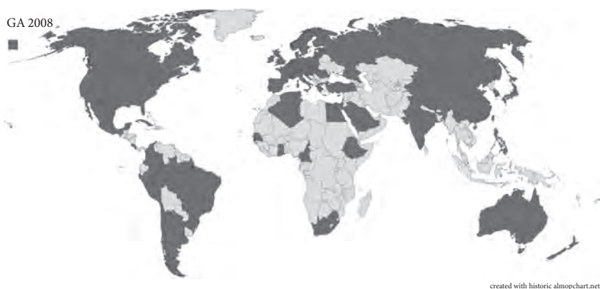
Figure 3.7 Map of IUPAP national members in 2008

Source: Members listed in IUPAP, Minutes of the 26th General Assembly, Japan, October 2008 , 2, available at https://archive2.iupap.org/wp-content/uploads/2013/12/file_50089.pdf [last accessed on September 8, 2023]. Created by the author with https://historicalmapchart.net/ .