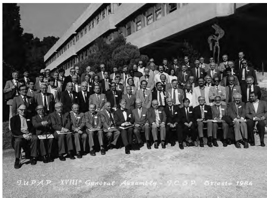
Figure 3.6 18th IUPAP General Assembly held at the International Center for Theoretical Physics, Trieste in 1984. It was the first General Assembly in which physicists from both PRC and Taiwan attended as official representatives