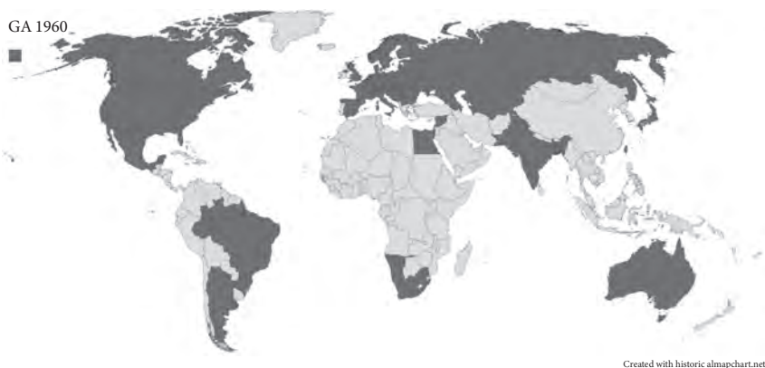
Figure 3.5 Map of IUPAP national members in 1960