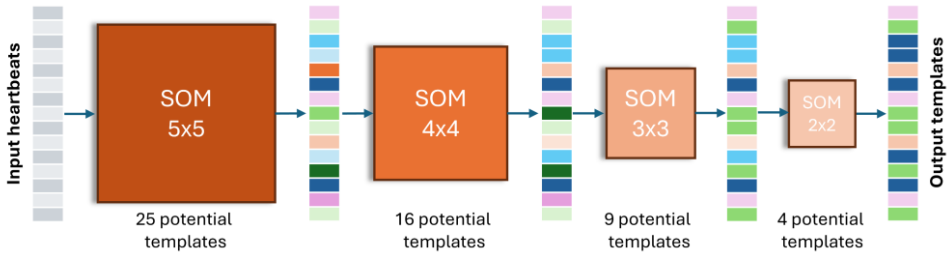
Figure 1. Pipeline of the proposed approach for heart sounds stratification.

the wins and the weights of the neurons are saved. Each element of the input matrix is replaced with the weights of corresponding winning neuron. The new matrix is used as input to train the next SOM. The process is repeated with the 4-by-4, 3-by-3 and 2-by-2 networks. The weights of the four neurons of the 2-by-2 SOM are candidate templates.