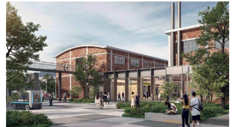
Fig. 2 | 6 Courtyards 1 Landscape, rendering of one of the public courts (credit: Politecnico di Torino - China Room).