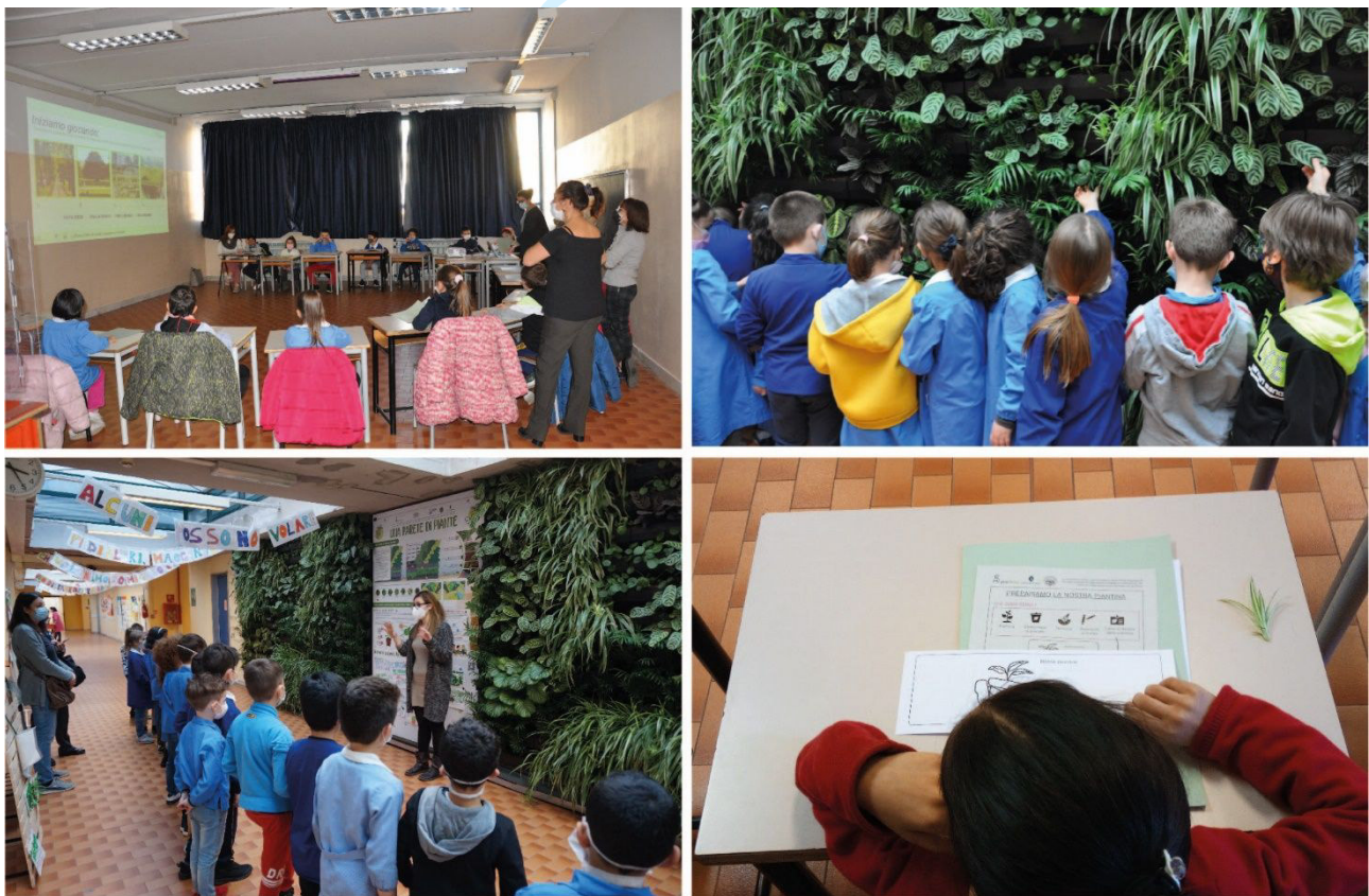
Figure 1: Moments of the activities performed and educational materials distributed to children as support during the activities of “Pareti Verdi a scuola” project (Source: Figure created by authors using their own pictures).