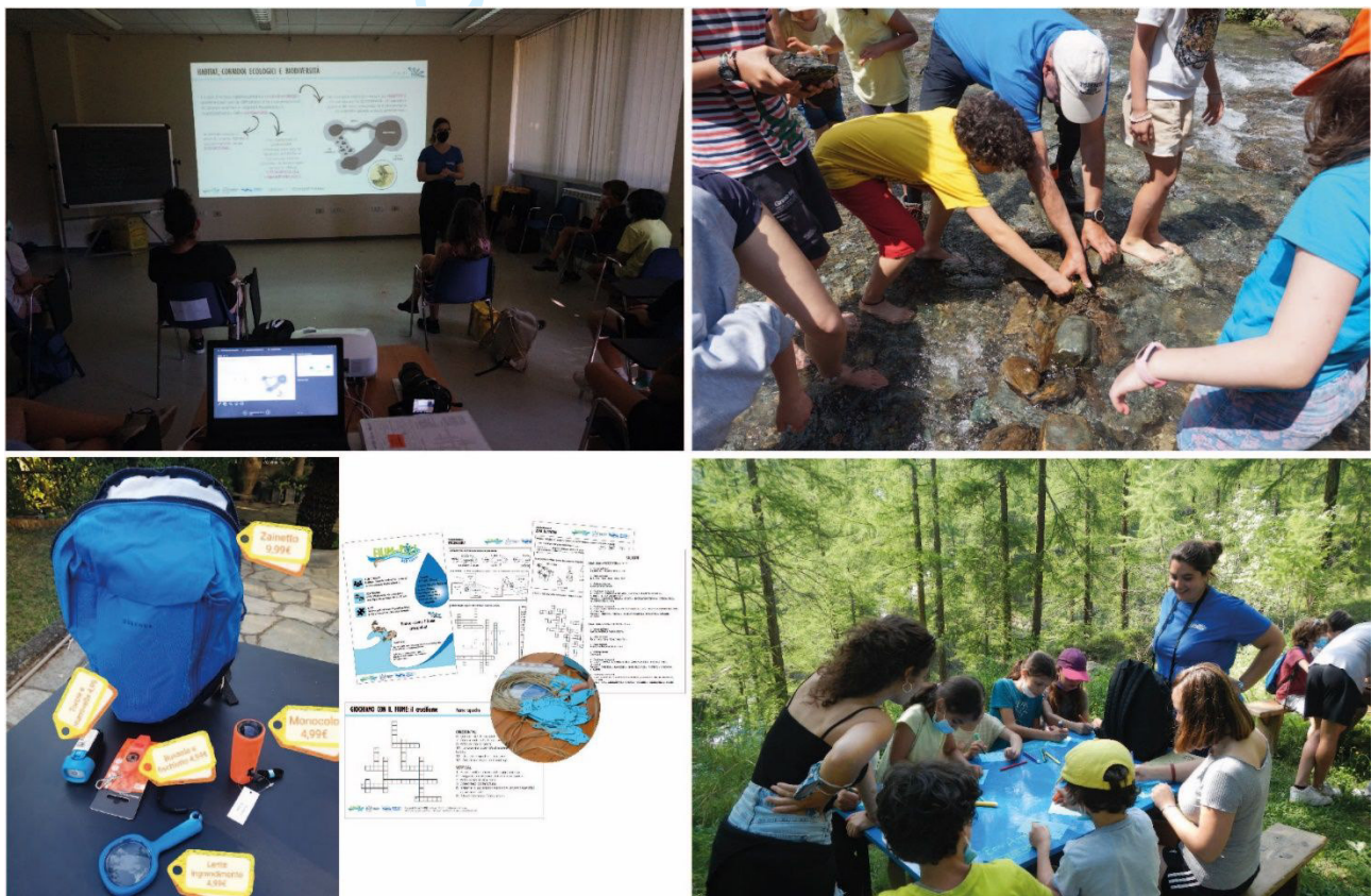
Figure 3: Moments of the indoor and outdoor activities performed, and educational-recreational materials distributed to children during the activities of “FIUM-POLI PERcorsi” project (Source: Figure created by authors using their own pictures).

In order to perform these activities, educational-recreational materials were prepared (didactic and educator cards, PowerPoint presentations, material for playful activities, etc.), and then distributed to children and educators (Figure 3).