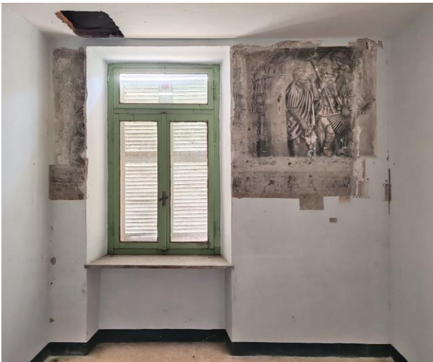
Fig. 3: One of the frescoed rooms on the second floor of the north wing belonging to an originally unified hall that was, over time, split with partitions and lowered with suspended ceilings. Note the superficial holes from the recent stratigraphic surveys and restoration of the building, as well as the deeper one to investigate its upward development

Therefore, they likely initiated the campaign to modernize the medieval pre-existing constructions on that lot, giving rise to the so-called Palazzo Principi d'Acaia at the turn of the 15th and 16th centuries. This date is apparently also asseverated by the recent interpretation of some frescoes inside the north sleeve (Calliero & Trombotto 2017, pp. 17-18) (Fig. 3). Based on the previous layout, the building is divided into three separate wings, yet interconnected in a U-shape, with a courtyard in the center.