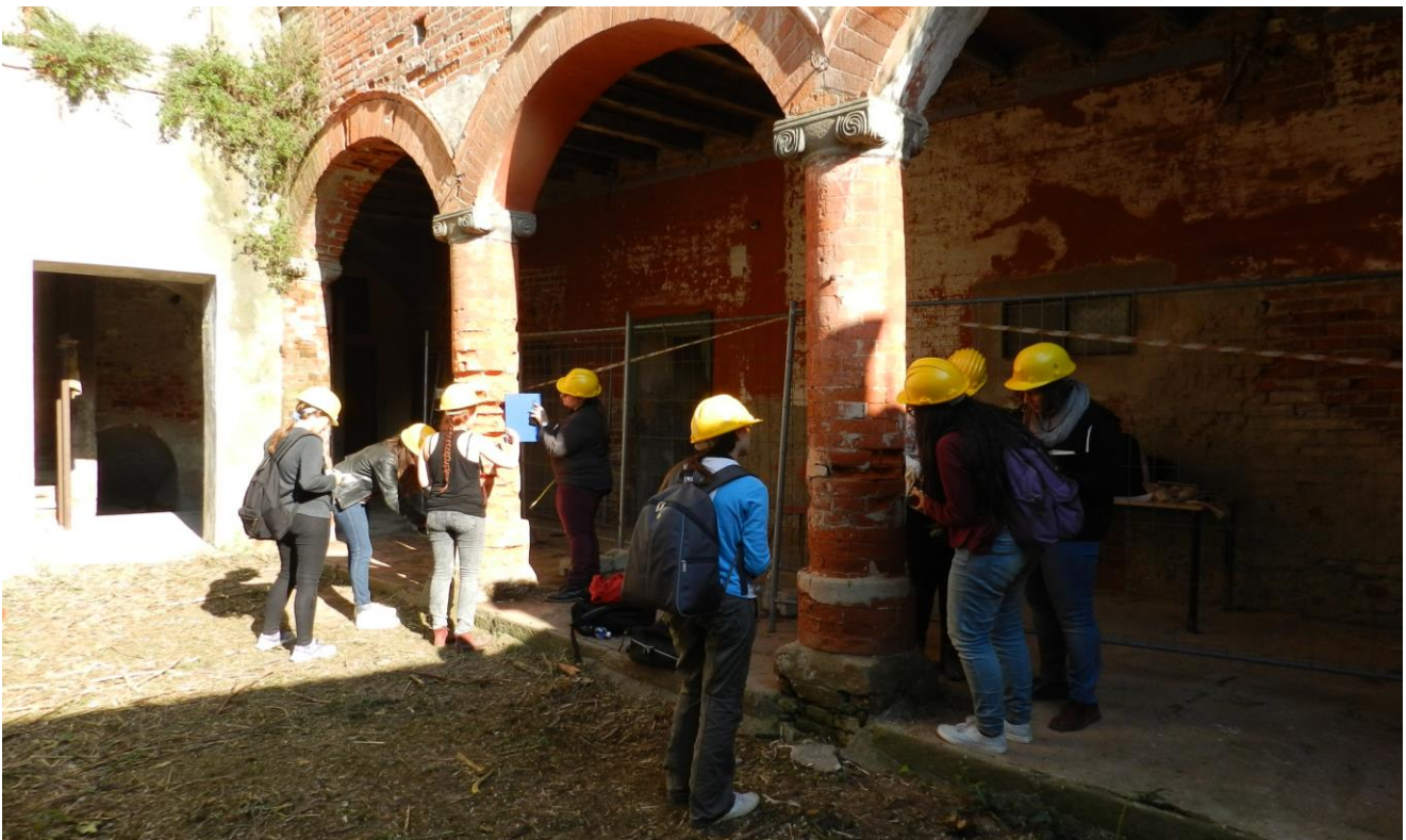
Fig. 6: Pinerolo, the so-called Palazzo dei Principi d'Acacia, seen from the court. Students engaged in activities to assess the state of preservation of brick columns (M. Mattone 2016).

Although partial, the surveys conducted have indeed allowed for a deeper understanding of the Palace and its state of preservation. They helped shed light on the multi-layered palimpsest that characterizes it and highlight critical situations