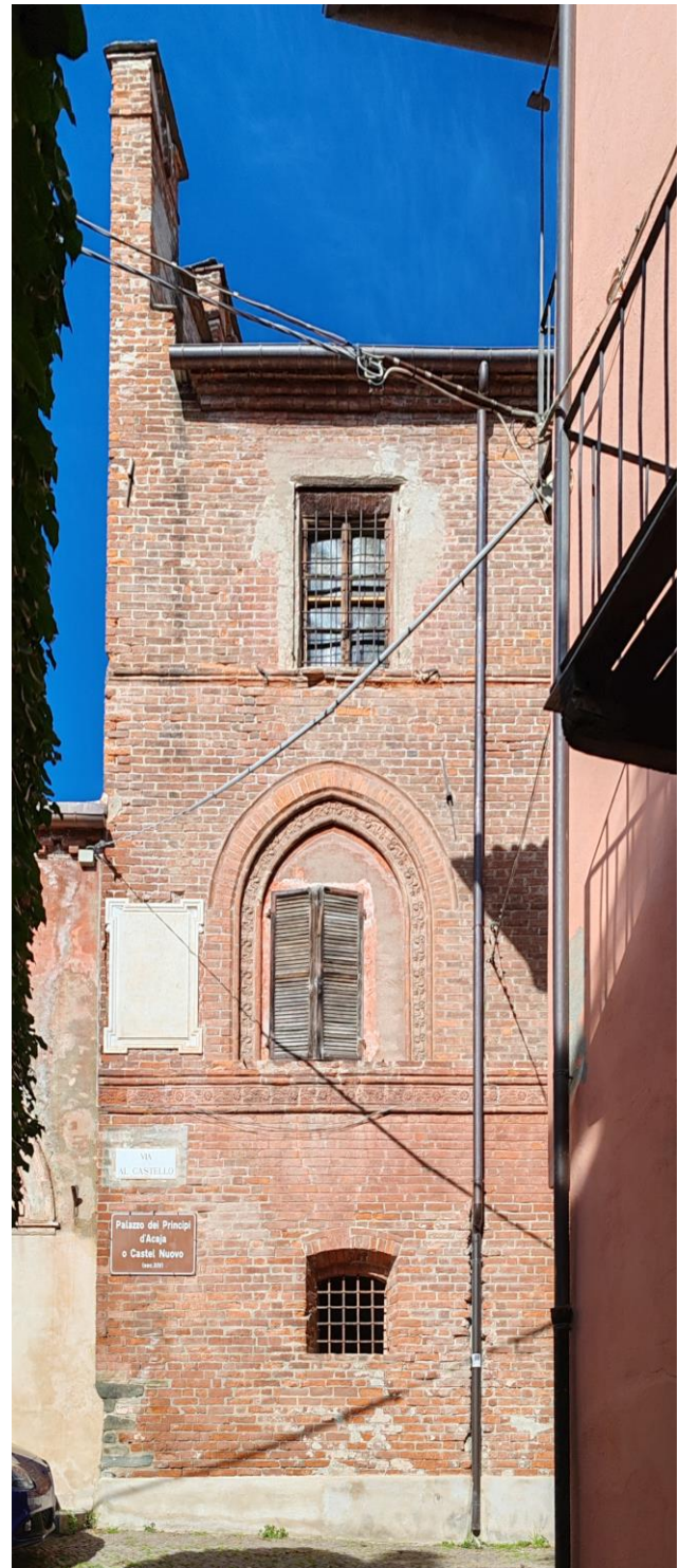
Fig. 2: The facade of the Palace on Via al Castello. Note the string course and one of the ogival openings with decorated terracotta elements (R. Rudiero 2024)

new investigation and historical research at the turn of the last century.