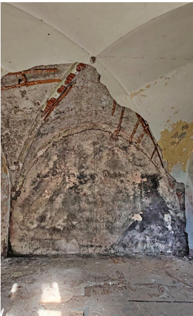
Fig. 4: The intervention to mask the ribbed vaults on the first floor of the north wing (R. Rudiero 2024)

The Palace is still unused and definitely not in optimal condition. However, thanks to the studies mentioned above, above all, to the interest of associations that statutorily pursue the preservation of historical heritage, and to the municipality's intervention, a virtuous circle has been produced, and a spotlight has been rekindled on the Palace and its preservation and valorization. The workshop we will now briefly go over is part of this process that led to the implementation of some safety and restoration interventions, as described in the conclusion.