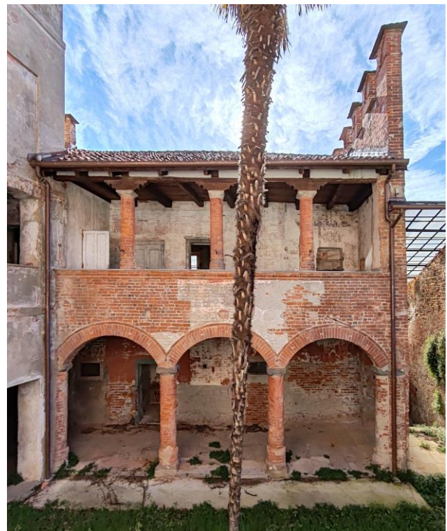
Fig. 5: Porch and loggia of the south wing, overlooking the inner courtyard

Alongside the now well-established tasks of education and scientific research, the university has long been entrusted with fulfilling what is called the “Third Mission” 3 . This requires Universities to turn to the socio-economic context by enhancing and transferring knowledge acquired in research activities. The aim is to promote the economic and social growth of the territory through interventions with cultural, social, and educational implications. With this in mind, the request for collaboration by the Associazione Italia Nostra Pinerolo section was accepted. It was decided to initiate a program of detailed investigation of Palazzo Principi d'Acaia to contribute to the elaboration of the project for the Palace's preservation and valorization by sharing the knowledge acquired through the analysis activities 4 .