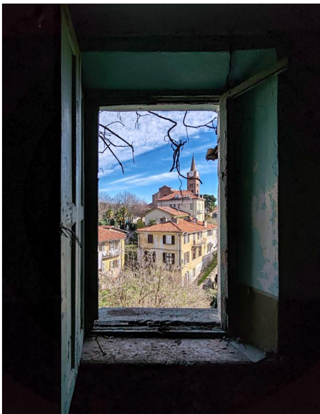
Fig. 10: View from one of the rooms on the top floor of the north wing. The proximity to the church of St. Maurizio, already part of the Borgo, clarifies the possible unintentional mystification about the Palace's ownership (R. Rudiero 2024)

Pinerolo area. By tradition and mythography – and also in a factual way (being an important architectural testimony of one of the pivotal centers of the Principality) – the Palace belongs to a specific branch of the Savoy family. Thus, in recent years, it has been involved in projects aimed at valorizing the entire territorial asset south of Turin by using the House of Acaia as a propeller for cultural tourism 7 . This occurrence had the merit of prompting new studies and research, producing a virtuous circle. This is demonstrated, for example, by the itinerant conference entitled Tutela, conservazione e valorizzazione dei beni Acaia in Piemonte (Protection, Conservation and Valorization of Acaia Assets in Piedmont), held in Turin, Pinerolo and Fossano in December 2018, organized by the Regional Council of Italia Nostra Piemonte, which also gathered several proposals on how to conserve the Palace in Pinerolo (Trombotto, 2019).