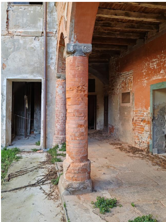
Fig. 8: The brick pillar of the porch on the ground floor, after restoration. The wooden ceiling of the covered side room has also undergone conservation work

Once this has been specified, it is essential to underline that the research carried out under the direction of the Polytechnic University of Turin was part of a broader and long-standing process, locally active through voluntary yet organically organized activities. They aimed to make the citizens aware of the values of an asset characterized by fragmentary knowledge and, above all, not properly preserved and used. So, with these renewed solicitations and the new analysis, the first restoration interventions designed to secure the Palace were carried out starting in 2019-2020. First, the roof of the south wing was rebuilt, and the wooden floor immediately below it was integrated and restored (Fig. 12). Analogous interventions were performed on the loggia floor. On its ground floor, the columns were consolidated (Fig. 8), and portions of eroded bricks pertaining to the dignified facade overlooking Via al Castello were reintegrated (Fig. 9).