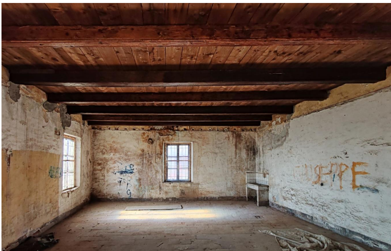
Fig. 12: Restoration work on the first-floor hall of the south wing. Subject to consistent deterioration due to infiltration, a new roof was recently built, and the corresponding floor underneath, previously concealed by a thatched ceiling, was restored. Most planks in this room have been replaced; instead, where possible, original beams have been kept (R. Rudiero 2024).

cooperative relations between them and the university are necessary. On this basis, and with a renewed commitment from the public administration, an out-and-out heritage community can be realized ( Council of Europe Framework Convention on the Value of Cultural Heritage for Society , Faro 2005) to best preserve the Palace in a way that makes it truly public, alive and vivifying.