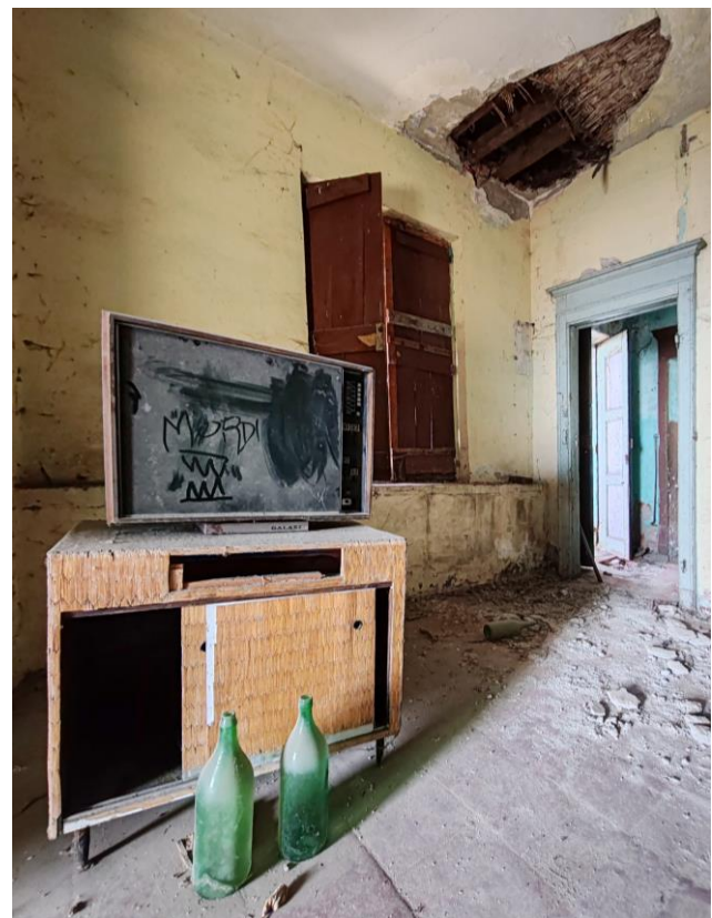
Fig. 11: Room on the upper floors of the east wing. The presence of furniture and furnishings denounces the Palace's last function, residence. Also note the partial fall of the thatched ceiling due to water infiltration, which required introducing a temporary covering to counteract the situation

However, several years have passed since then. The most pressing interventions on the complex have been carried out, but it has emerged that a lot still needs to be done. More studies would certainly be needed to enhance the already conspicuous analyses of the state of preservation. Archaeological investigations, including excavation and analyses of the building body, would also be useful in determining the construction periods and subsequent stratifications with certainty.