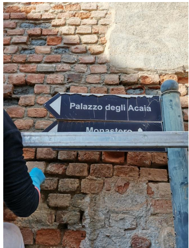
Fig. 9: Reintegration of detached bricks on the main exterior facade (R. Rudiero 2020)

The realization of all these interventions has allowed the asset to be usable again, at least in its external parts. Indeed, as of September 2020, it is periodically open to the public. This is also possible thanks to the efforts of Italia Nostra volunteers, who organize guided tours to foster a more widespread knowledge of this complex stratigraphic palimpsest. Thus, it is now part of a larger city route, a destination or crossroad of an urban-scale valorization. It also includes theatrical performances narrating the true or alleged events that occurred within the complex.