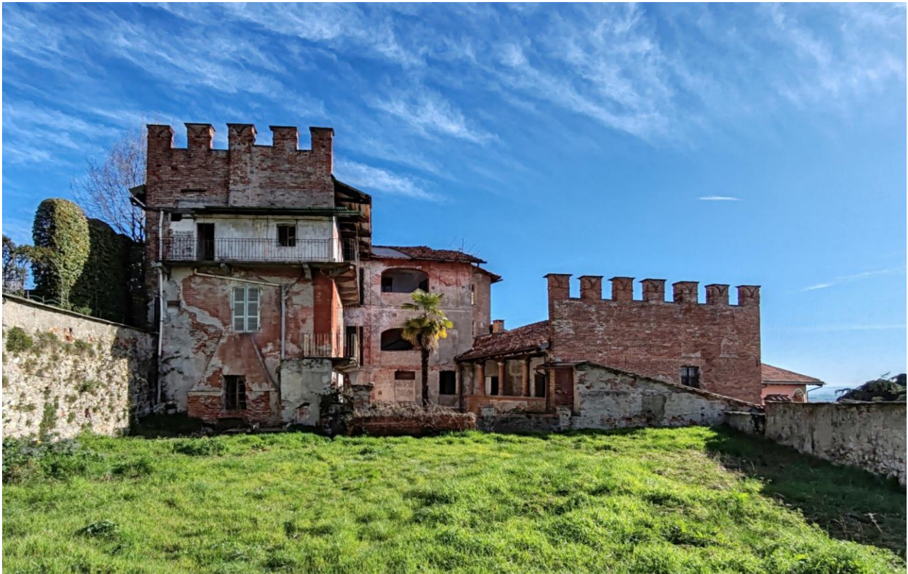
Fig. 1: Pinerolo, the so-called Palazzo dei Principi d'Acaia, seen from the garden. The building results from the amalgamation of several units, whose architectural language was later uniformed during the Renaissance period (R. Rudiero 2024).

and opportunities, risks, and the objectives of the project” (Icomos 2020, p. 36).