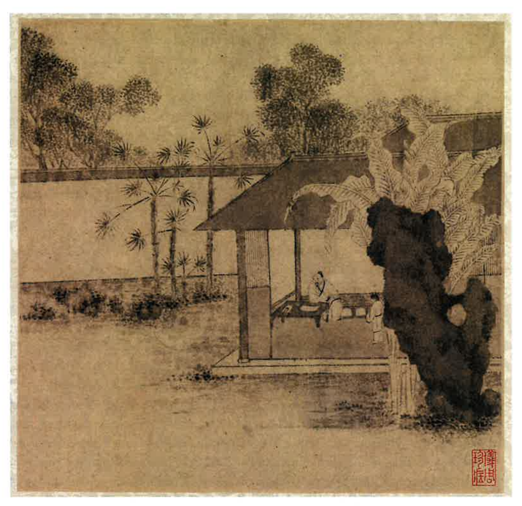
Fig. 4 Wen Zhengming, Garden of the Inept Administrator. Album, leaf d, 1551. Metropolitan Museum of Art, New York. Gift of Douglas Dillon, 1979.

The relation between Chinese gardens and rural landscape appeared in the Jesuits' accounts as early as 1705, in a letter written by French Jesuit Jean-François Gerbillon (1654–1707) and published in 1713. In it, Gerbillon provided a short description of the pleasure garden of the Kangxi emperor comparing it to a frag-