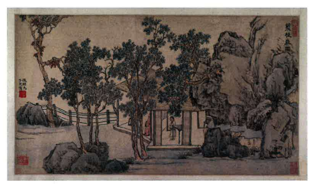
Fig. 2 Wen Zhengming, The Cassia Grove Studio. Handscroll, ca. 1532. Metropolitan Museum of Art, New York. Gift of Douglas Dillon, 1989.

The crafted natural appearance of Chinese gardens exerted a prolonged fascination on Western observes. In their writings compiled in the seventeenth century and in the early eighteenth century, Western travellers emphasized the ability of the Chinese in shaping the ground of their gardens by constructing an artificial topography that reproduced elements of the natural landscape. Among the range of natural forms reconstructed in the gardens of China, travellers focused on a specific feature they considered the most relevant characteristic of those gardens' natural quality: artificial mountains. (fig. 2) Travellers appreciated the skills necessary to build them, along with the inventiveness and ingenuity that the creation of these topographic forms entailed.