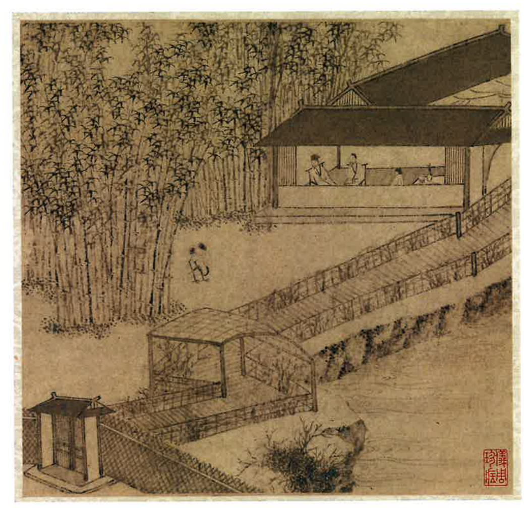
Fig. 3 Wen Zhengming, Garden of the Inept Administrator. Album, leaf c, 1551. Metropolitan Museum of Art, New York. Gift of Douglas Dillon, 1979.

ileged perspective on Chinese gardens. From the beginning of the century, Jesuit missionaries initiated a new approach in their observations, intended to codify the design principles of that garden inspired by the natural landscape. Jesuits turned to an image that was much different than rough nature, expressed by the artificial mountain, to convey their perception of the gardens of China: the countryside (figs. 3–4). The image of the countryside the Jesuits proposed represented the gardens' apparent natural simplicity and, at the same time, it expressed a complex composition that consisted of a great variety of natural and architectural elements harmoniously juxtaposed within the articulated topography of the gardens.