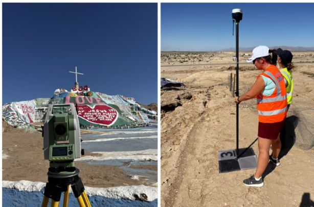
Figure 2. Topographic and GNSS survey.

Survey details are described within the survey report (McAvoy et al., 2024) and here summarized. The survey campaign has been carried out on October 25 th , 2023. The entire area has been documented integrating traditional and experimental Geomatics techniques. Employing a DJI Mavic 3 Pro, a multi-scale Uncrewed Aerial Vehicle (UAV) survey has been performed, acquiring both nadir and oblique images to collect data regarding the entire site and the surrounding area. Terrestrial photogrammetry has been employed to document the indoor environment of the "Hogan" (a Navajo name for certain adobe structures), the northern nook, where the slope had collapsed, and all the trucks, tractors, and cars placed in the Salvation Mountain area. Also, both a TLS and a MMS approach has been adopted to acquire data concerning the overall complex, including the indoor part of the Museum. A total of 47 static scans have been acquired using a Leica RTC360 system, and as regards the MMS survey, 3 scans of 15 minutes each have been performed employing a Stonex 120 GO platform. A topographic and a GNSS survey have been performed for the metric control and georeferencing of the final 3D point clouds (Figure 2).