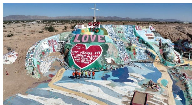
Figure 1. UAV picture of Salvation Mountain.

In this paper we present a case study involving an important American folk-art site called Salvation Mountain (Figure 1), an area of approximately 9.5 square kilometers located in the middle of the Colorado Desert (California, USA).