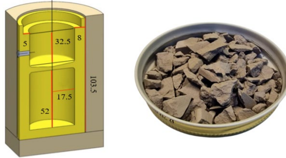
Figure 1. On the left, a schematic representation of the experimental setup (actual dimension in mm). On the right, pellets of composite samples.

is only valid under adiabatic conditions neglecting thermal losses to the environment, which the authors determined that could be done safely.