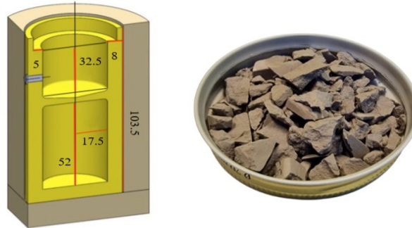
Figure 1. On the left, a schematic representation of the experimental setup (actual dimension in mm). On the right, pellets of composite samples.

is only valid under adiabatic conditions neglecting thermal losses to the environment, which the authors determined that could be done safely.