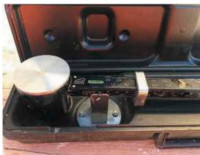
Figure 3. Mud balance used for the unit weight assessment. (Todaro et al., 2023).

The unit weight was assessed by using a mud balance (Figure 3), according to the standard ASTM D4380 (2020).