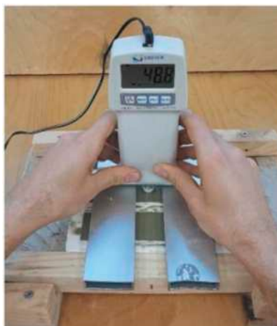
Figure 6. Dynamometer used for the surface compression strength assessment during the test. Todaro et al. (2020).

The test consists of the penetration of the bit orthogonally on the cast surface of the grout (previously cast in moulds with the shape in compliance to CEN (2016) and cured for 1 or 3 hours in a sealed environment) till a penetration of 5 mm is reached. The maximum force (F in equation 2) reached during the test is recorded. SCS is consequently computed according to equation (2) where F is expressed in N.