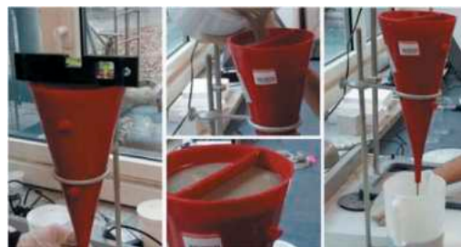
Figure 4. Marsh funnel used for the flow time assessment (Todaro et al., 2023).

The flow time was assessed by using the Marsh funnel (Figure 4), in line with UNI 11152-13 (2005). This test provides indications on the viscosity of the tested material. The outcome of the test is the time spent by 1 L of mortar to flow through the funnel. The higher the viscosity of the mortar, the higher the flow time.