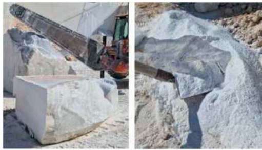
Figure 2. Chain cutting machine used for splitting the marble blocks in slabs (on the left) and the marble sludge obtained during this cutting operation (on the right).

Considering the ornamental stone processing chain, the cutting operations are important since blocks of huge dimensions ( \text{m}^3 of order of magnitude) are split into easily transportable slabs, suitable for further processing (Figure 2, left). Taking into account the Italian scenario, marble quarries are by far the most common, yet other types of ornamental stone quarries are also present on the national territory. For the reason of “abundance”, authors have selected marble sludge as an experimental ingredient in this study (Figure 2, right).