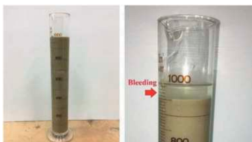
Figure 5. Bleeding assessment. (Todaro et al., 2023).