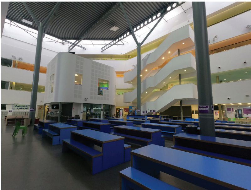
Figure 1. BDP (2011) designed school: Central atrium, image by trafi-prats, L (28/11/2021).

many BSF buildings, was centred around a multi-functional atrium, containing space for circulation (allowing access to classrooms, offices and a central theatre) as well as for dining, studying, socializing, and 'informal learning' (BDP, 2008, p. 6), all of which are allowed to overlap (see Figure 1).