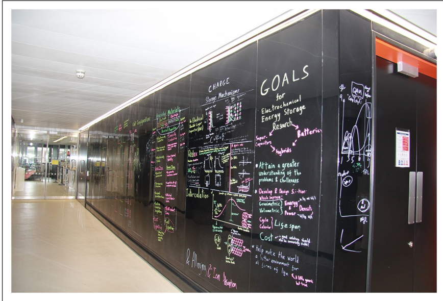
Figure 6. The writeable wall in the energy lab corridor.