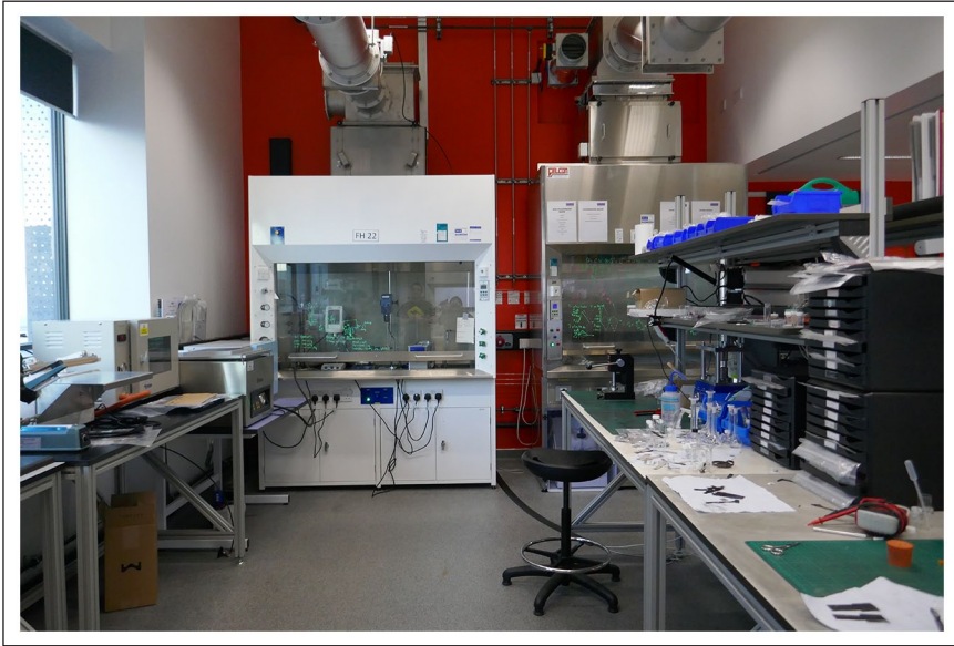
Figure 2. The energy lab.