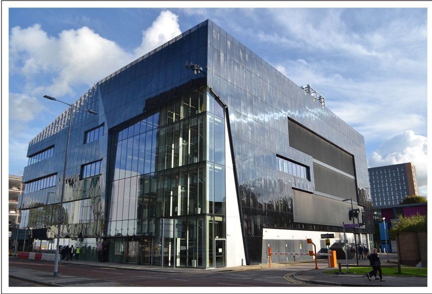
Figure 1. The National Graphene Institute, Manchester, UK.

hexagonal-lattice of carbon atoms. Completed in 2015 and now full of life, six years after construction, the dust has settled and the workers have moved onto another site down the road.