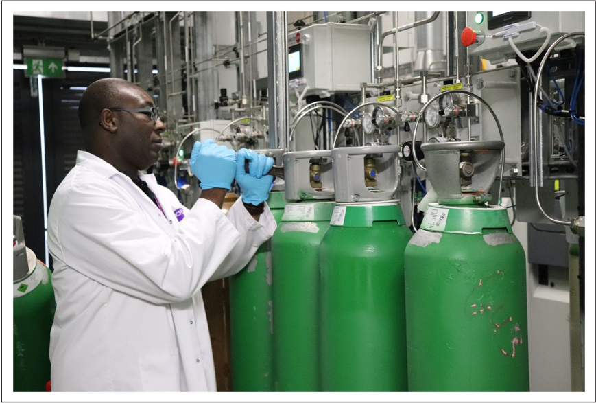
Figure 4. The gas room.