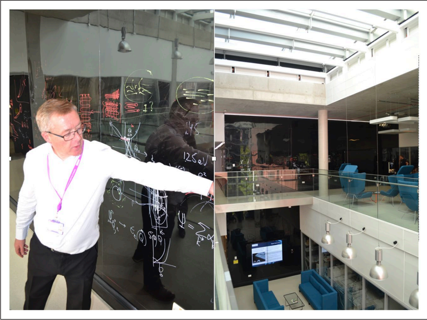
Figure 5. The writeable walls in the atrium.