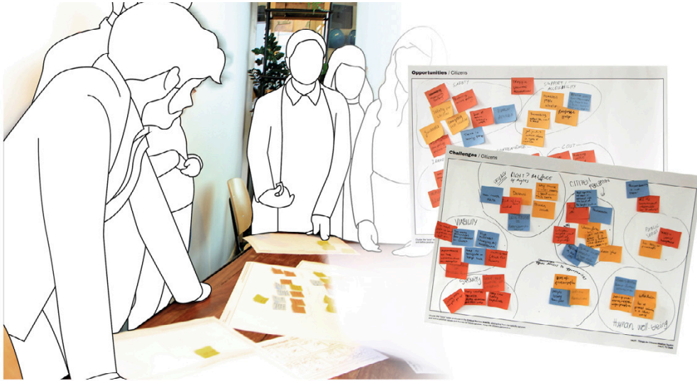
Fig. 3. Participants engaged in the clustering phase of the workshop and final clustering boards.

government, and citizens gain new capabilities. For example, surveillance robots may increase the autonomy and independence of citizens. As envisioned during the workshop, children or elderly could be accompanied to their homes while being guarded from security threats by the robot identifying anomalies in its environment. This may provide them greater freedom to move around, knowing that they have a personal guard that will prevent problematic situations.