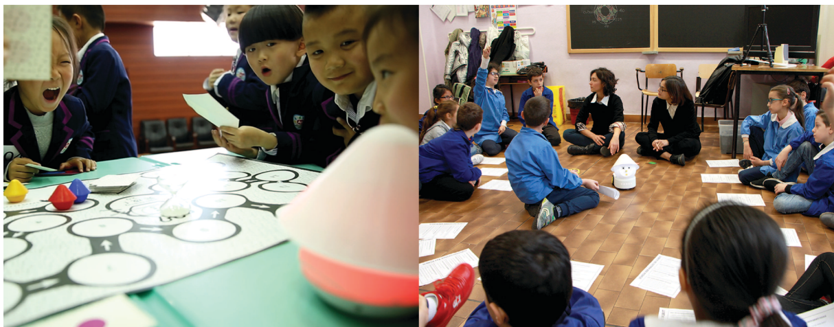
Figure 2. Left: Children playing a game with Shybo. Right: Children analysing Pinocchio during the first meeting of the experience “Bringing Pinocchio Home”.

In this occasion, Shybo’s learning ability was used to design a playful activity for introducing children to simple principles of colour theory and to reflect on sound qualities. To do so, it was introduced to children as “a small and shy robot that is very curious about sounds, but who doesn’t know how to interpret them, and get scared from too much noise” . The fact of not knowing how to interpret the environment around it, represents the motivation why Shybo needs children’s help. In fact, they were asked to train it with the sound of musical instruments for creating a sort of sound-colour code. The central aspect of this activity is that the code resulted from a process on reflection and discussion established by children who had to play the musical instruments, recognize similarities among those sounds and group them accordingly, and then choose colours for the categories. The sound-colour code was, then, used to play a board game that required children to remember the combinations and coordinate in groups.