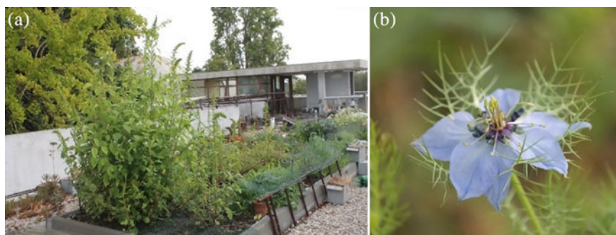
Fig. 28.4 a Green roof built at the Instituto Superior de Agronomia campus—as part of the green roof lab, Universidade de Lisboa, Portugal; b detail of Nigella damascena plant.