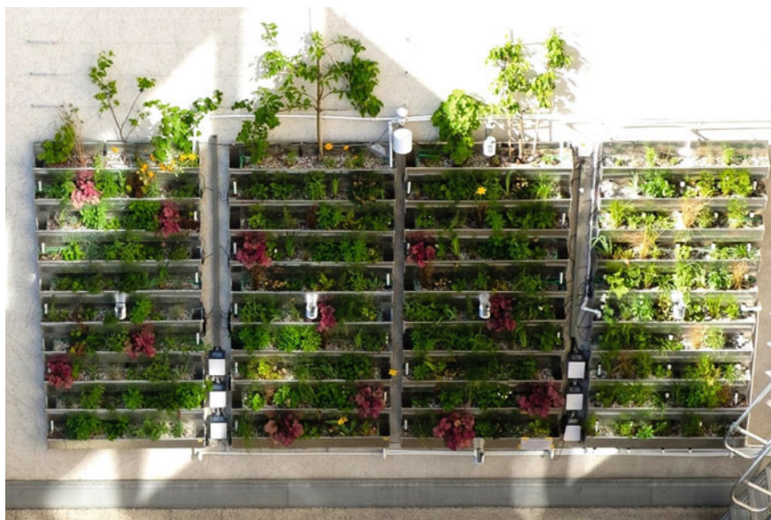
Fig. 28.3 Vertical greening system at the University of Natural Resources and Life Sciences Vienna (BOKU), Vienna, Austria. The system has a total size of 6m x 4m and consists of four individual systems with their own irrigation system. Monitoring included air and substrate temperature, substrate water content, precipitation, solar radiation, irrigation water volume and system output [13]

The Roofood project [27, 28] evaluated the suitability of wild edible plants to find enhanced sustainable production solutions for urban farming in GRs. A collection of plant species was sown in a GR at Instituto Superior de Agronomia (Universidade de Lisboa, Portugal) campus (Fig. 28.4), with the selected following three criteria: (i) used in traditional gastronomy; (ii) from areas with environmental conditions of equal or greater demand than the Lisbon area; and (iii) species with resilience traits. Such traits minimize the need for external resource inputs such as water and energy, fertilizers and pesticides.