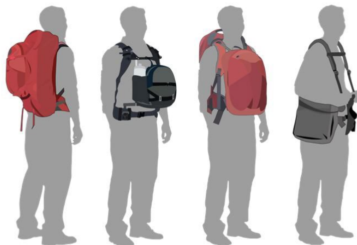
Figure 1. From left to right: backpack, front pack, double pack and T-pack.

The reviewed articles included both female and male participants belonging to three main groups: schoolchildren, adult hikers/athletes and military personnel. The different typologies of packs are illustrated in Figure 1.