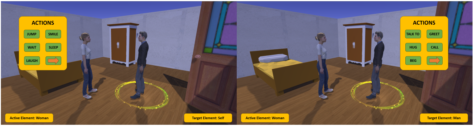
Fig. 2. An example of the UI panels available to select the actions based on the active actor (the woman) and the target (the woman herself on the left, the man on the right).

between the two views only affects the functionalities available to the users.