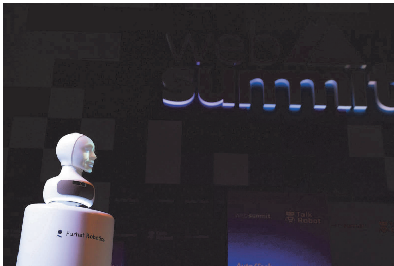
Fig. 1. The Furhat Robot (2022) designed by the start-up Furhat Robotics.

robotic head that can be modelled after a range of human likenesses through the choice of skin colour, expression of the eyes, mouth, and nose [7]. Experiments that could, in part, be introduced into telepresence machines as well, where the goal of greater acceptance of the robot as a mediating element in human-to-human relationships at a distance is driving research to explore different levels of characterization, most of which use quotation and allusion, particularly in body definition.