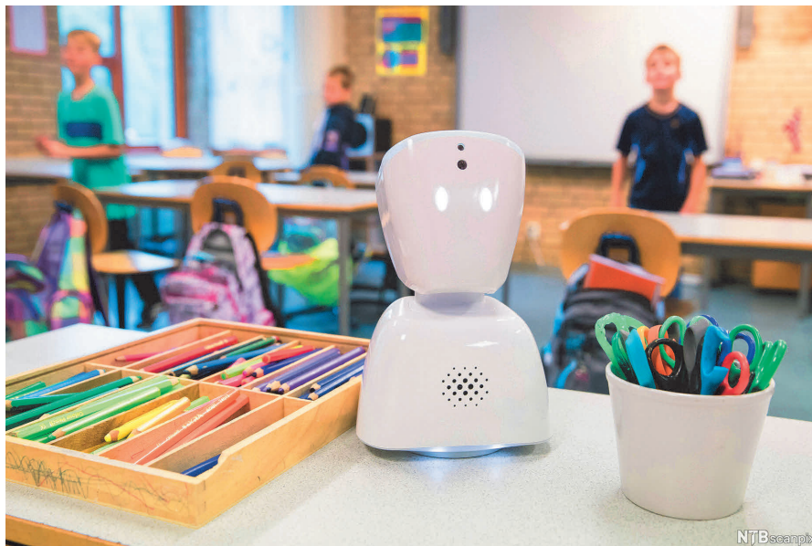
Fig. 2. Av1 Robot by No Isolation designed for education technology for inclusion.

The characterisation in telepresence assumes an increasingly important role, as it is a factor in the interpretation of the individual's personality. As a result, initiatives for do-it-yourself construction are emerging, as in the case of Smartipresence (Fig. 2), made by The Crafty Robot, a low-cost telepresence robot associated with a smartphone. The small cardboard robot is designed to support one's smartphone, which enables remote communication via audio, video and movement. Smartipresence was created as an expansion of the Smartibot kit, where the user can build his or her robot with printed circuit boards, motors and a battery, choosing the physical cardboard embodiment from several available characters.