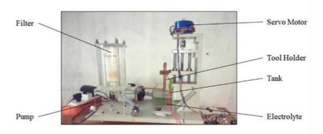
Figure 1. Experimental setup.