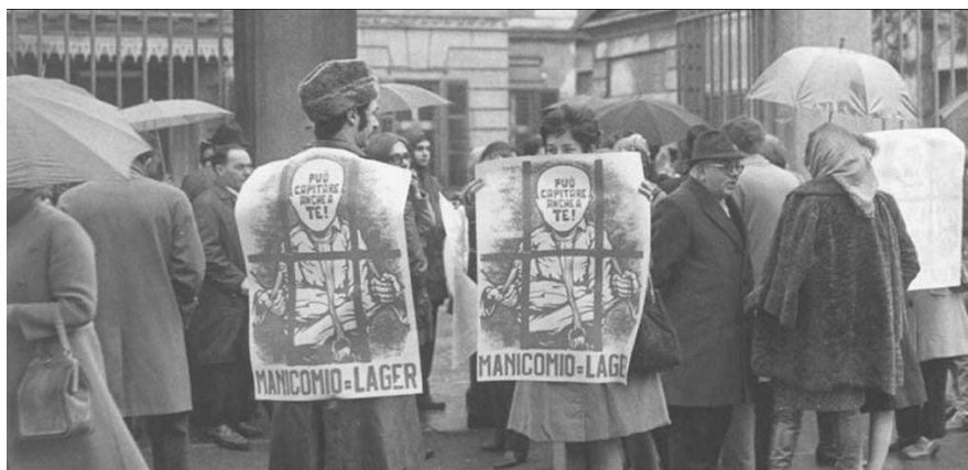
FIGURE 1 Demonstration in front of the asylum in Via Giulio, Turin. Poster made by ALMM: 'Madhouse = lager; It can happen to you too'.

Methodologically, the paper is part of a wider PhD research project carried out via participant observation and life-history interviews organised into a series of post-asylum geographies of mental health care operating in Turin. The research includes the intimate and everyday responses of individuals, with the aim of building up a micro-geography that, by putting the human and its everyday life at the centre of its inquiry, makes individuals' 'embodied and contested subjectivities ... emerge more clearly' (Parr, 2000, p. 226). Through a life-history approach enriched by an auto-ethnographic