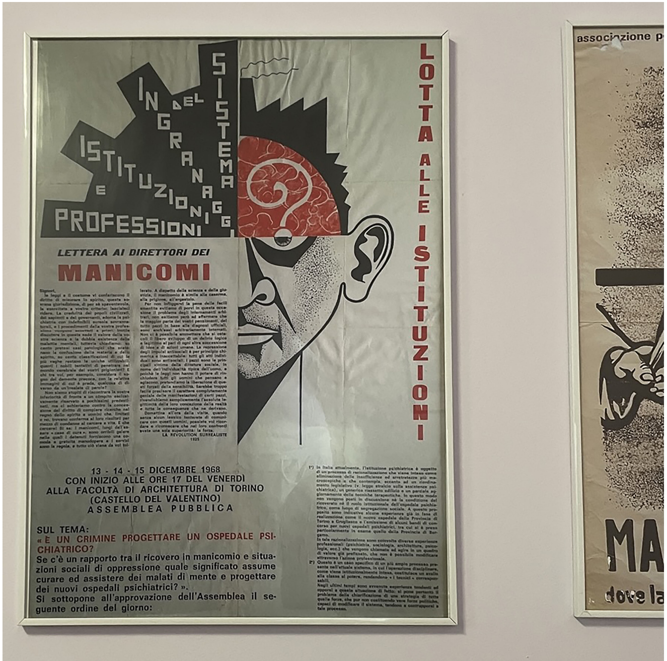
FIGURE 2 Poster of a public assembly at the Valentino Castle. The red title on the right reads ‘fight to the institutions’ while the main body of the text is a letter to the directors of the asylums, accused of being ‘cogs of the system’. The title of the event (bottom left corner) was ‘Is it a crime to build a psychiatric hospital?’. My translation.