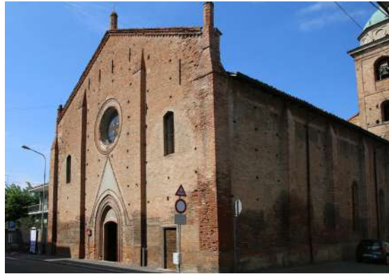
Fig. 1 The façade and the South-East flank of the church of Santa Maria Assunta in Pontecurone (2022).