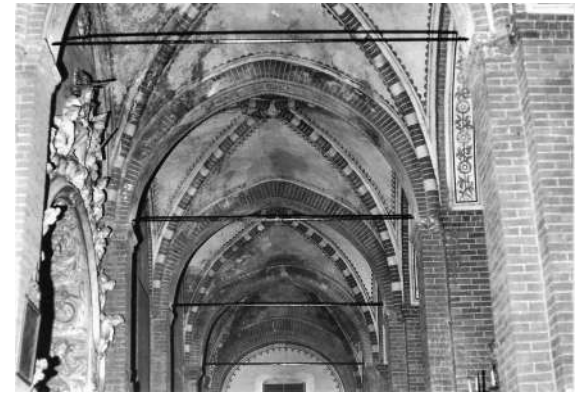
Fig. 2 The chains in the left nave during the restoration yard of 1974-1977.

Endoscopic inspections were performed inside the disconnections in the cement tiles floor