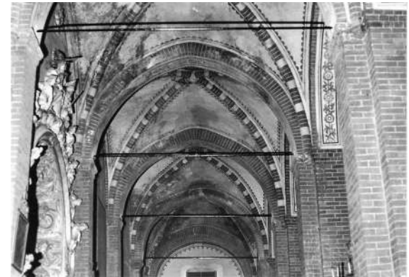
Fig. 2 The chains in the left nave during the restoration yard of 1974-1977.

Endoscopic inspections were performed inside the disconnections in the cement tiles floor