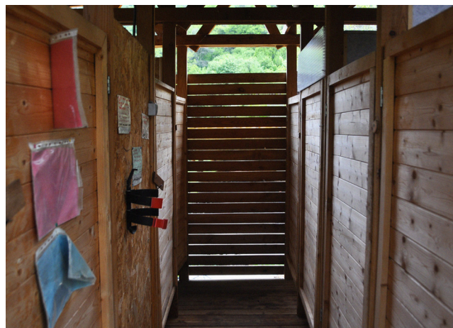
Figure 4 Dry toilets and showers installed on the farm

Soon the site started to represent a point of reference for those wishing to help people in transit in the valley. The site, labelled "Le Camping" or "Le Camp," was completely self-sufficient and managed by the farmer, volunteers living in the valley, or those coming from the neighbouring territories, as well as the people welcomed who actively took part in the self-management of the shelter. Various associations started to assist in place, providing legal aid, French language courses, artistic ateliers, and medical aid to the vulnerable people, managed by Médecins du Monde. Around 2,500 persons have been hosted on the farm since 2015, with peaks of arrivals in the summer of 2017. The farm was also one of the most emblematic case of the intense militarisation and control by law enforcement in the valley: the strong mediatization of the figure of Cedric Herrou and the importance that his farm acquired in the valley as the main space of reception led to remarkable police pressure in close proximity of the site, with up to five police checkpoints surveilling 24/7 at one point. The constant militarisation of the farm has highly contributed to the general decrease of people transiting in the valley, significantly reducing numbers in the shelter.