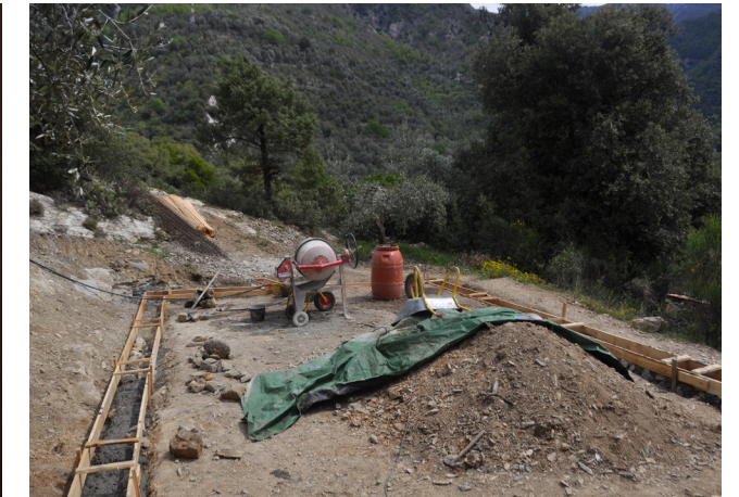
Figure 7 Volunteer workshop for the reconstruction of a burned henhouse