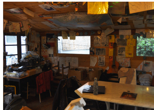
Figure 5 The common area, full of decoration, drawings and memories left by former inhabitants and volunteers in the Camping