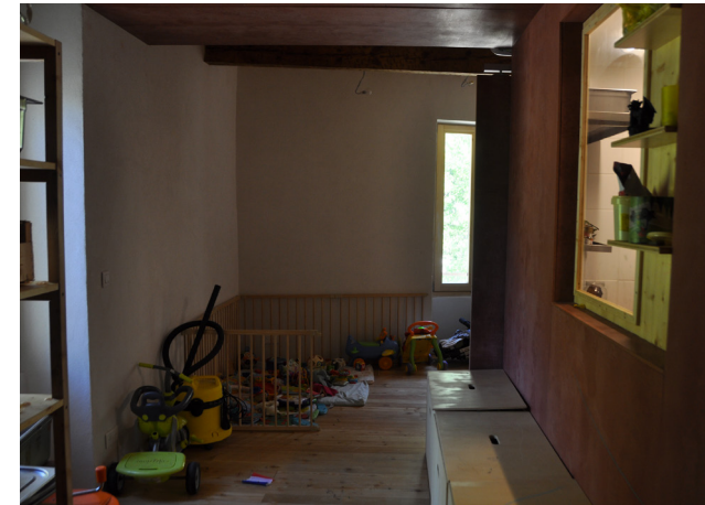
Figure 6 A common area in La Tuilerie with a large kitchen, sofas, toys, etc.