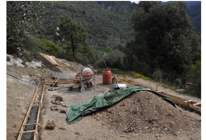
Figure 7 Volunteer workshop for the reconstruction of a burned henhouse