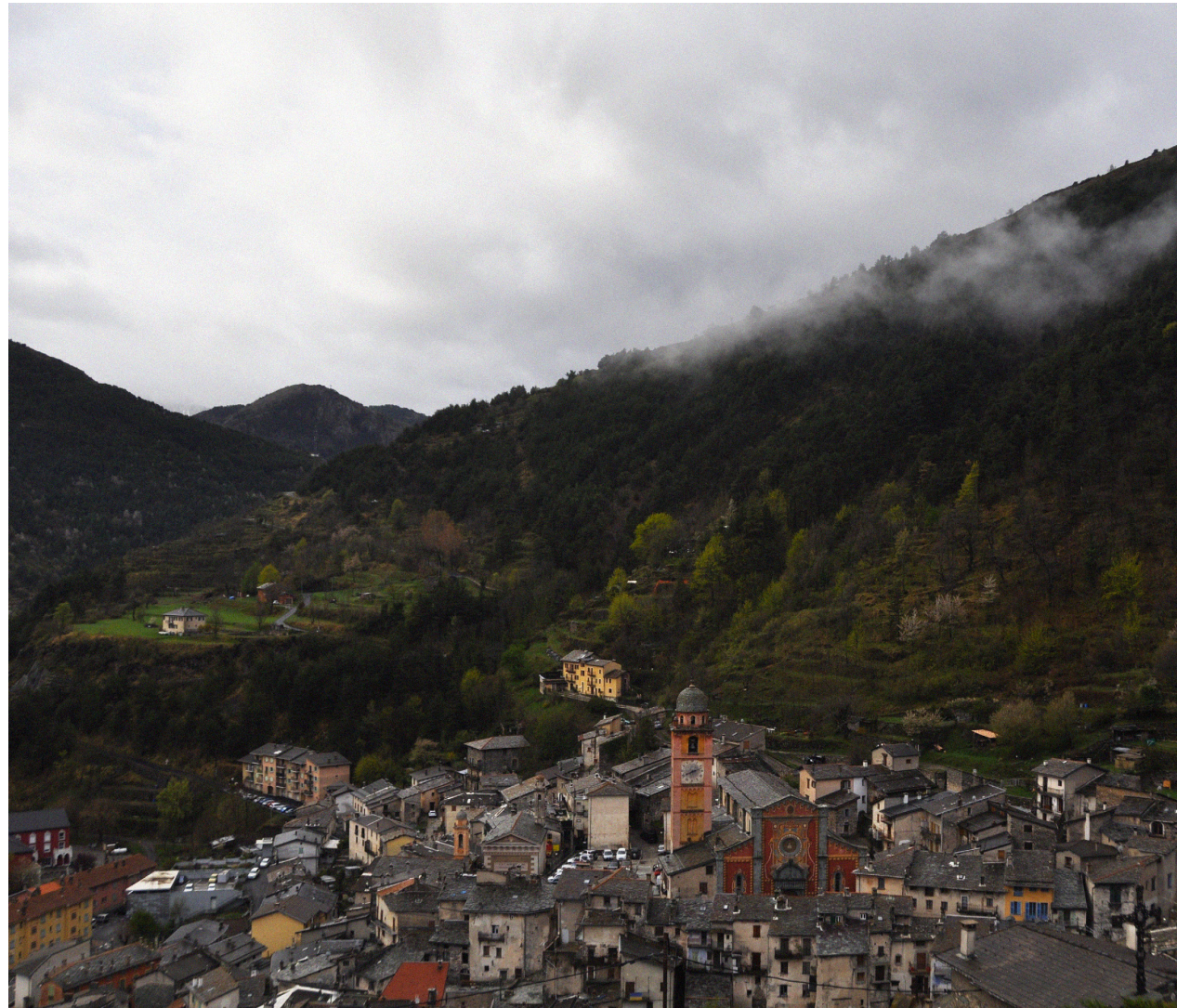
Figure 1 Vallée de la Roya. View over Tende.