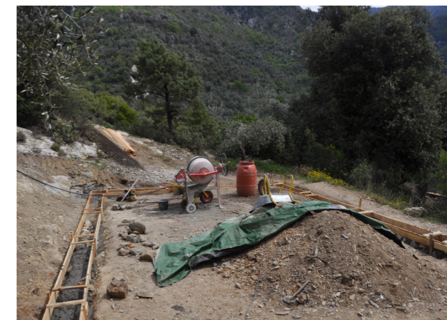
Figure 7 Volunteer workshop for the reconstruction of a burned henhouse