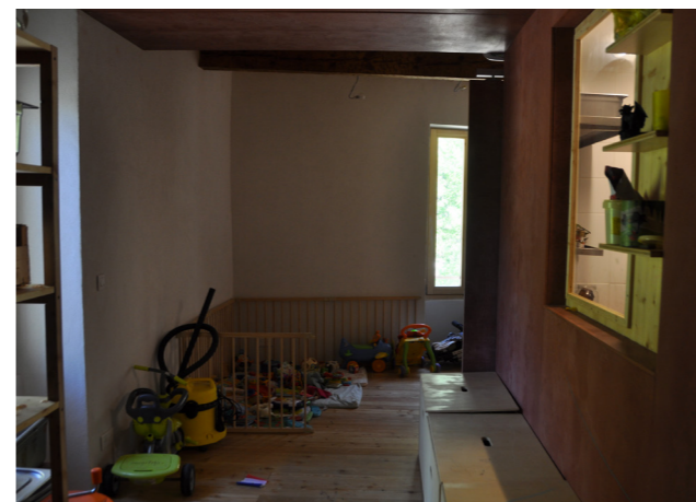
Figure 6 A common area in La Tuilerie with a large kitchen, sofas, toys, etc.