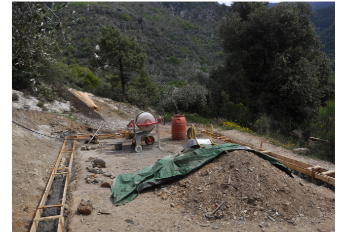
Figure 7 Volunteer workshop for the reconstruction of a burned henhouse