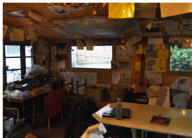
Figure 5 The common area, full of decoration, drawings and memories left by former inhabitants and volunteers in the Camping