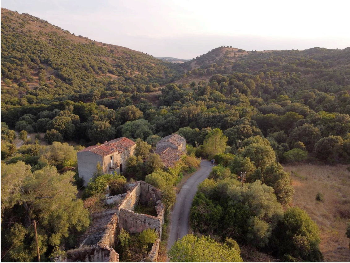
Figure 5. The abandoned village of Badu Andria, near Padru

The municipality of Padru moved in this direction in 2022, carrying out the “Antichi Borghi” project, part of the territorial development program of the Sardinia Region, which aims to promote knowledge of the small historic villages that arise around the town. In these sites, illustrative panels have been inserted in different languages which, through a QR code, lead to the Municipality website where further information is available. In this sense, the project gives a new meaning to these forgotten ruins, bringing them back into an area of widespread and shared culture among citizens. It is desirable that initiatives like this succeed in stopping at this stage, without going further. Unfortunately, however, the road that leads to the recognition of the eminently cultural value of these objects as ruins still appears long: from the few information found on the web, it seems that a second part of the project is expected. Referring to this next phase, in September 2022 the mayor of Padru said that the project plans to "convert some abandoned buildings into B & Bs" 5 .