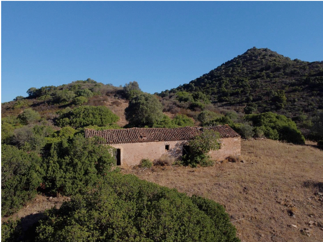
Figure 1. An abandoned stazzo near Olbia with all its architectural characteristics intact.

Brandanu 2013), a word which indicates both the building type designated as a residence, and the complex of service buildings and land for grazing livestock. and agriculture. The origin of this type of social organization linked to the stazzi is uncertain, as it