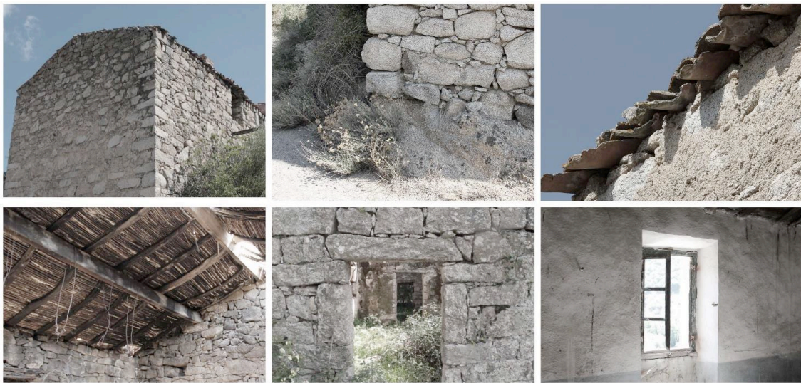
Figure 3. The recurring constituent elements in the architecture of the stazzi

The most usual conformation with which this type of building still appears today is that of a modestly sized house, made of granite, with a rectangular plan, sloping roof and minimized openings.