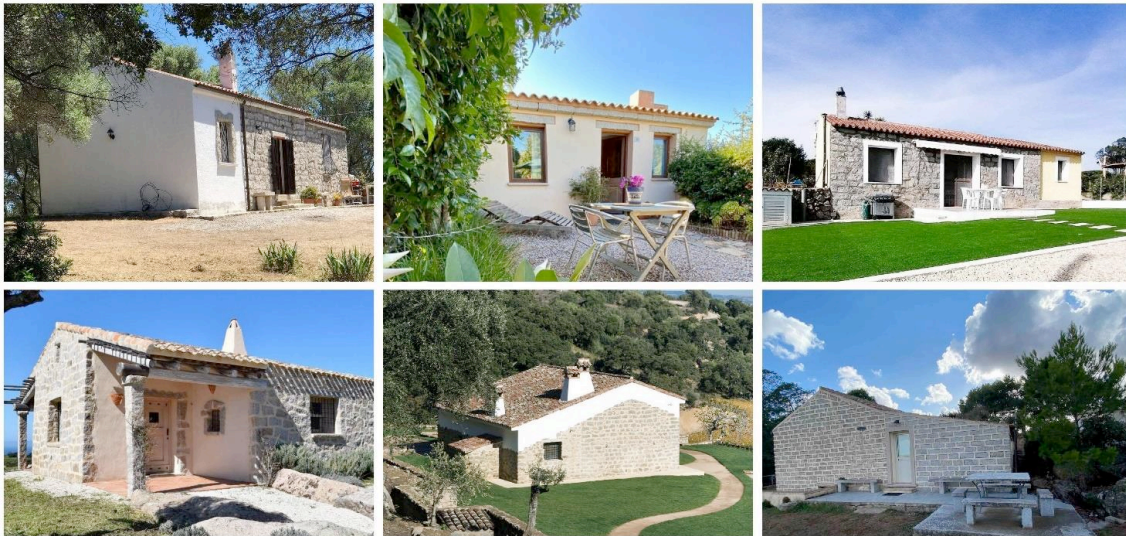
Figure 4. Some “restored” stazzi found on internet using web-sites as Air Bnb and Bookin

recurring constructive characteristics in the stazzi are: rectangular plan, total or partial absence of foundations, load-bearing dry or lime mortar walls, minimized openings, brick tile roofs. The countryside that still surrounds these residential areas, as already mentioned, represented a fundamental place for the self-sufficiency of families, since it included all the spaces dedicated to breeding and agriculture. As evidence of the use of the land, numerous low dry-stone walls still remain visible in the Gallura countryside, in many cases preserved in good condition, arranged in a circular shape, which once performed different functions: they defined the boundaries of the possessions of the various stazzi , divided the different crops, delimited the spaces intended for livestock or delimited the boundaries of a square inside the inhabited center, separating the civil from the rural.