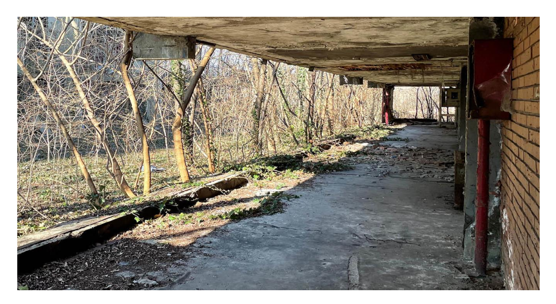
Figure 3. Istituto Marchiondi from Vittoriano Viganò, Baggio (MI), ph. Valentina Labriola (2022)

Concerning wasteland, the intention is to restore or demolish more abandoned areas as possible in the case of buildings. This action shows the usual tendency of the architecture in the design of the vacant space. The propensity is planning these spaces, trying to include them in the city through a violent transformation that denies the unique qualities of the wasteland instead. Urban voids can trigger the imagination of new alternative public spaces while simultaneously positively influencing the ever-present re-urbanization and re-naturalization process (Lopez-Pineiro, 2020). These places' ecological and socio-cultural power allows the design of a new kind of open space that considers the presence of an unseen nature. As Gilles Clément argues, "Abandoned areas constitute the principal refuge for the pioneers of exhausted, bare, 'turned over', or littered soil" (Clément, 2002, p.111). Indeed, it is visible how nature affects the voids in different aspects, firstly, in the aesthetic.