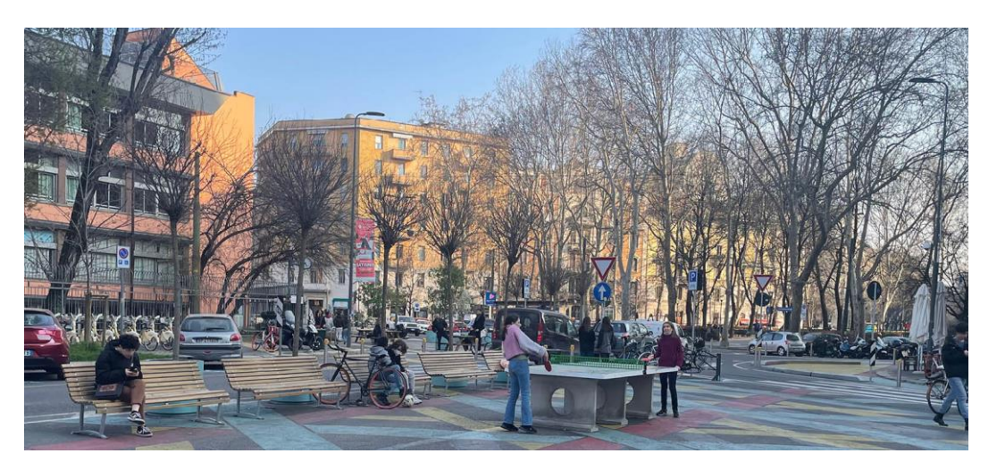
Figure 1. "Piazza Aperta" in Piazzale Bacone, Milan (2022)

It is unequivocal how the effect of the COVID-19 crisis does not affect only our private everyday life but also the way we live in the public space. However, it is possible to consider the positive impact of re-thinking the contemporary city meaning through its community places. The answer of the public administrations was usually accelerating some public actions. The Metropolitan City of Milan promoted, for example, a considerable intervention both in public space use and slow mobility.