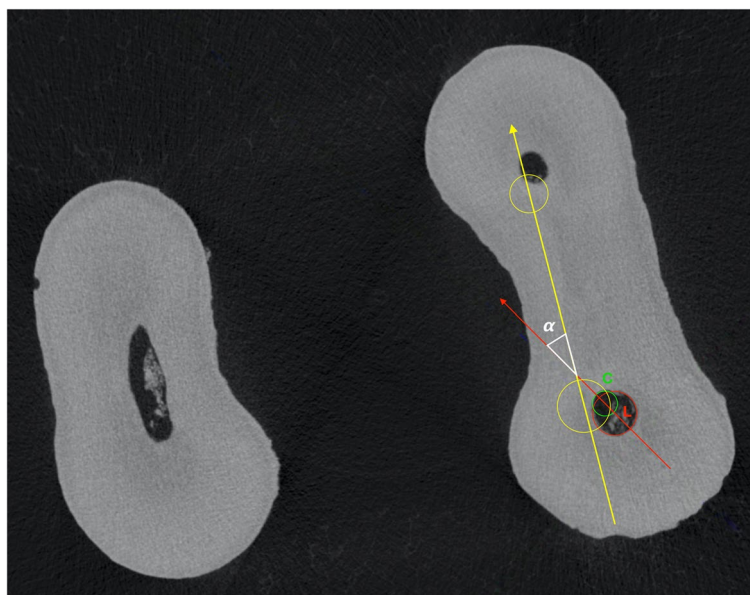
Fig. 2 The vector drawn between the geometric center of the endodontic ledge (L) and the center of the original canal lumen (C) (red line). The internal angle ( \alpha ) is described between this vector and the line joining the centers of the mesio-buccal and mesio-lingual root canal orifices (yellow line)

errors [15]. The geometric center of the ledge (L) was identified in the post-operative scans while the center of the original canal lumen (C) was visualized in the corresponding pre-operative sections. After the pre- and post-operative cross-sections superimposition, a vector passing through L and C was calculated for each sample (Fig. 2). Afterwards, the center of the mesio-buccal (MB) and mesio-lingual (ML) canal orifices was determined on the pre-operative scans in the sections corresponding to the pulp chamber floor. The internal angle ( \alpha ), formed between the vector passing through L and C and the line joining the centers of the MB and ML canal orifices was measured once the geometric overlap between section